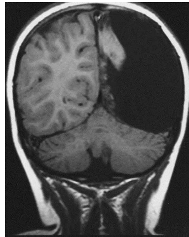
Fig. 2 Brain scan of a seven-year-old girl who led a normal life with minimal impairment after removal of her dominant cerebral hemisphere at age three to relieve the symptoms of chronic focal encephalitis (Rasmussen syndrome).

A modern metaphor for information relating to long-term memory being held outside the brain is “cloud computing.” Even though the Internet emerged in the 1990s, it has