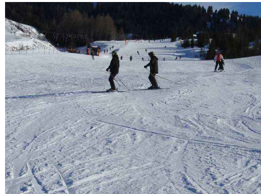
resort: 99% snowboard: 1%