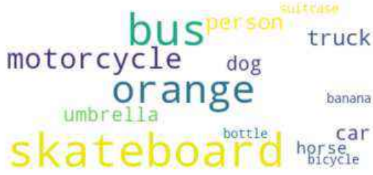
(b) Scene: road