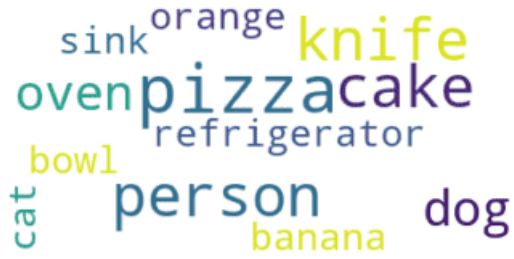
(a) Scene: kitchen