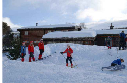
resort: 3% person: 96%