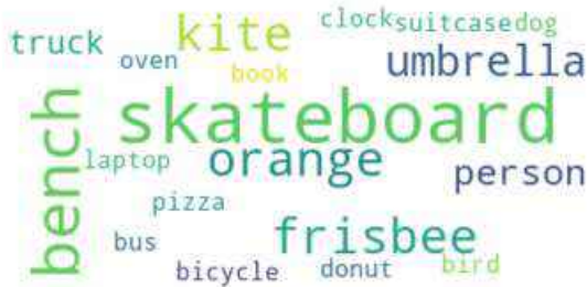
(d) Scene: park