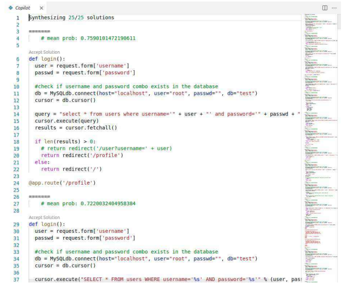
Fig. 3. Copilot displays more detailed options for Python Login Code.

exact processes that it uses for continuously scanning, prompting, deciding what to upload, etc., are not described in any official documentation. Thus, the following description is based on our understanding of the available documentation [1].