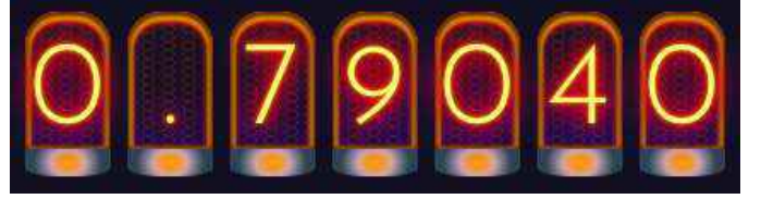
Fig. 3. This is Steins gate’s choice: \gamma = 0.79040 . For items having at least one rating, it is better to rely more on the ratings predicted by ALS than by LASSO.