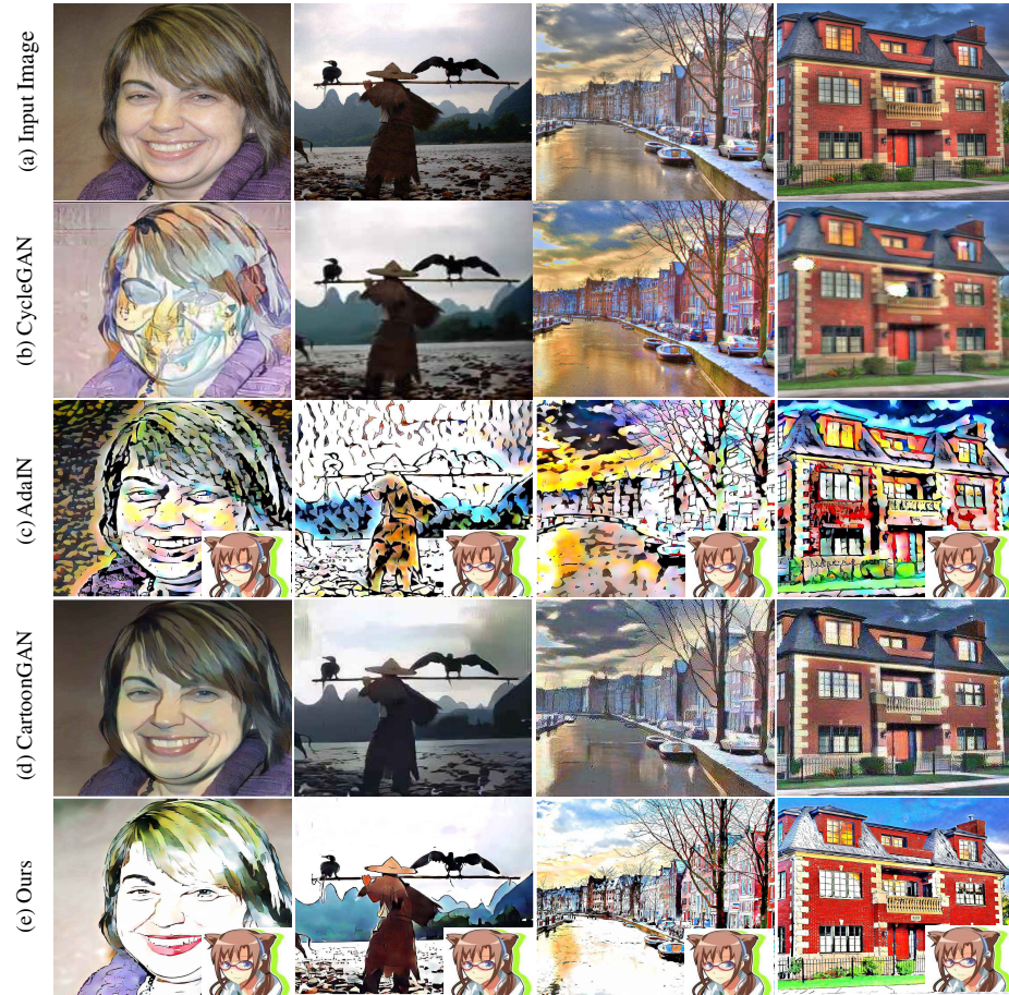
Fig. 3. Cartoonization results of different methods

Refer to Figure 3, we show the qualitative results generated by different methods, and all of the test data are never observed during the training phase. It is clear that CycleGAN [17] and AdaIN [6] can not work well with the cartoon styles. In contrast, CartoonGAN and our CartoonRenderer produce high-quality results. To preserve the content of the input images well, we add the identity loss to CycleGAN [17], but the stylization results are still far from satisfactory. AdaIN [6] successfully generates images with smooth colors but suffers from serious artifacts. CartoonGAN [3] produces clear images without artifacts, but the generated results are too close to the input photos and the color distribution is very monotonous. In other words, the extent of cartoonization with CartoonGAN [3] is not enough. In contrast, our method apparently produces higher-quality cartoonized images, which have high contrast between colors and contains very clear edges.