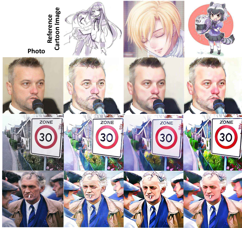
Fig. 1. Some cartoonization results of CartoonRenderer with different reference cartoon images.

formulates image stylized rendering as an optimization problem that translating the style of an image while preserving its semantic content. This method produces promising results on transforming images in traditional oil painting styles, such as Van Gogh's style and Monet's style. However, it suffers from long running time caused by tremendous amount of computation. Based on Gatys's pioneering work, some researchers have devoted substantial efforts to accelerating training and inference process through feed-forward network, such as [6][8][12][2][16]. Some methods follow this line of idea that employs a feed-forward network as generator to generate stylized results and achieve significant success. Since cartoon style is one of artist styles, many existing methods used for artistic style transfer can also be used to transform realistic photographs into cartoon style. However, even state-of-the-art methods fail to stably produce acceptable results with input content photos in the wild, especially for the high resolution photographs that full of complex texture details. The main reasons are