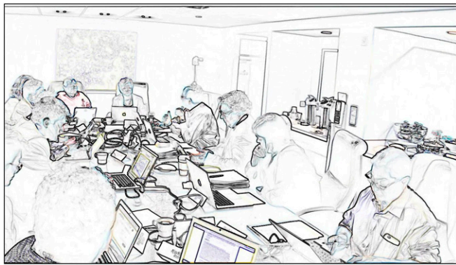
Fig. 1. Deidentified image from one of four peer-review panel meetings.

funding recommendations to the director of the NIH institute or center that awards the funding. Reviewers in study sections are prohibited from discussing or considering issues related to funding and instead are encouraged to rate each application based on its scientific merit alone.