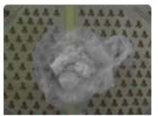
2 g of Speed / Amphetamine TOP QUALITY $40.00