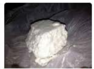
1 gram high quality cocaine $191.81