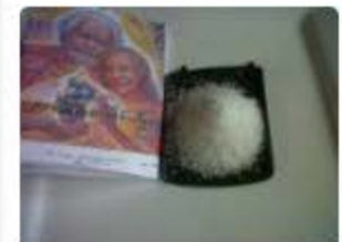
3g Methylone Crystals -50- Lab Grade $50.00