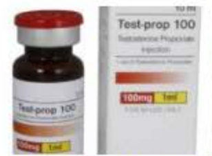
testosterone propionate 10ml x 100mg $132.75