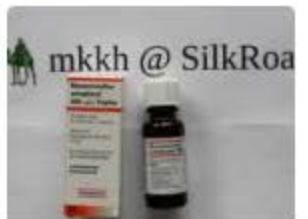
20 ml Novalgin (Metamizol) *flüssig* $16.50