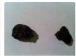
1 gram of Blue Magic Black Tar Heroin (85% pure) $145.82