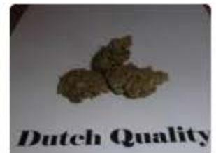
5 gram Amnesia Haze (Real Dutch Quality) $107.72