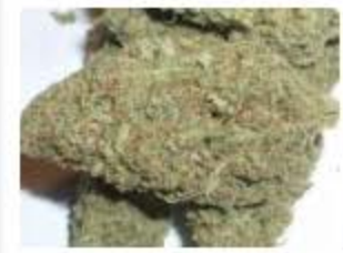
7g TRAINWRECK x GREEN CRACK NUGGETS - FREE $100.00