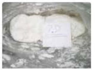
10 GR 60 % PURE > DUTCH SPEED < $96.44