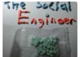
10 x 120mg MDMA Mitsubish Ecstasy Pills *AUS ONLY $209.99