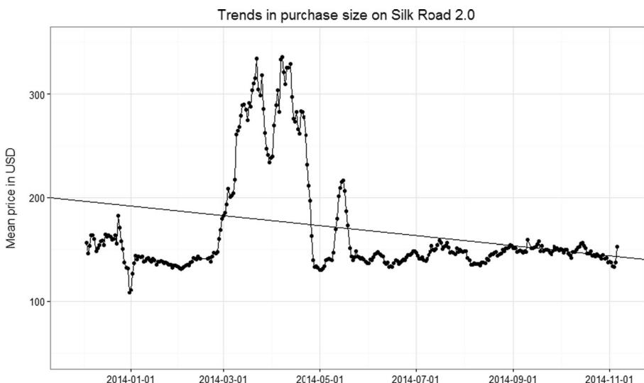
Graph 2 Trends in purchase sizes on Silk Road 2.0

As with Silk Road 2.0, Agora Marketplace showed a tendency towards smaller purchase sizes over time. We found a significant ( p = 8.637e-05 ) negative