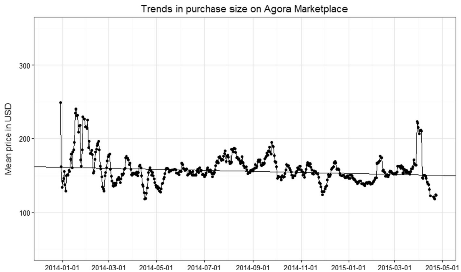
Graph 3 Trends in purchase sizes on Agora Marketplace

coefficient ( -0.02316756 ), attesting to a decline in the size of purchases on Agora Marketplace as well.