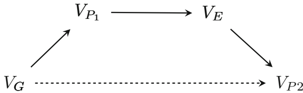
Fig. 2 The causal structure of active and reactive G–E Covariance. Variation in genotype ( V_G ) causes variation in a phenotype ( V_{P1} ), which causes variation in the environment which individuals experience ( V_E ). This in turn causes variation in a different phenotype ( V_{P2} ). V_G may also cause V_{P2} directly, as indicated by the dashed line. For more detail on this causal structure see “ Appendix ”

hair colour ( V_{P1} ), which causes variation in the environment experienced ( V_E ), which in turn causes variation in a secondary phenotype, such as IQ ( V_{P2} ). This may be made more fine-grained by including an additional variable after V_{P1} ( V_X ), representing differences in the way the foci individuals are treated by others, which is a more direct cause of variation in the environment experienced. In Fig. 2, V_X is encompassed as part of the more general variable V_E . Thus V_G causes V_{P2} indirectly via V_{P1} and V_E . Under an additive account of heritability (Eqs. 1, 2) the resulting phenotypic variation for IQ would be attributed to V_G because of this indirect causation via the covariant societal abuse variables ( V_X and V_E ).