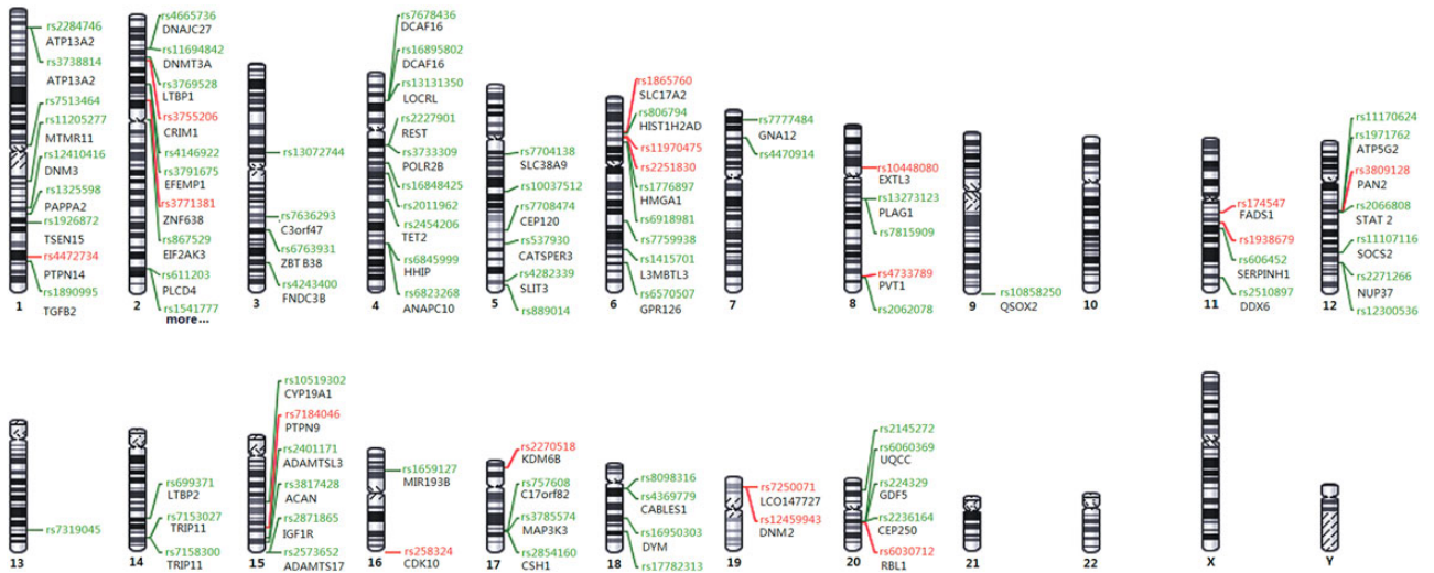
Figure 1. The 98 loci associated with adult height in East Asians. The genome location of the 17 novel loci (in red) and 81 previously reported loci (in green) was shown by each chromosome. The chromosome numbers were shown in blue. The figure was created by using Affymation ( http://genepipe.ngc.sinica.edu.tw/mkr/menu.do ).