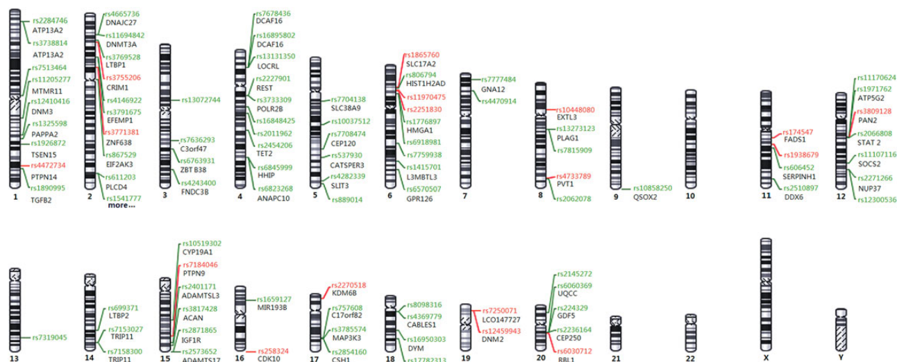
Figure 1. The 98 loci associated with adult height in East Asians. The genome location of the 17 novel loci (in red) and 81 previously reported loci (in green) was shown by each chromosome. The chromosome numbers were shown in blue. The figure was created by using Affymation ( http://genepipe.ngc.sinica.edu.tw/mkr/menu.do ).