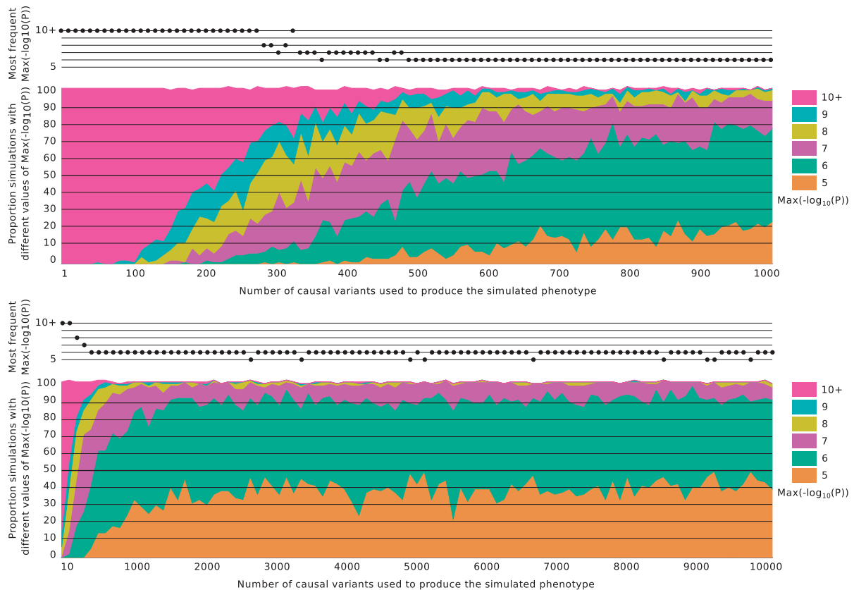
Figure 2. Distribution of smallest P -value in the genome-wide association studies (GWAS) with simulated phenotypes as a function of the number of causal single-nucleotide polymorphisms (SNPs) used to generate them. Simulated phenotypes were produced with a number of causal SNPs varying from 1 to 1000 (a) and from 1 to 10 000 (b). The effect of causal SNPs were drawn from a normal distribution, and the heritability of the simulated phenotypes was fixed at 50%. Ninety five percent of simulated phenotypes with <220 causal SNPs had a smallest P -value < 10^{-8} . In contrast, simulated phenotypes produced with >500 causal SNPs had most often a smallest P -value of the order of 10^{-6} or 10^{-5} . The top plot in a and b shows the most frequent order of magnitude of the smallest P -value as a function of the number of causal SNPs.