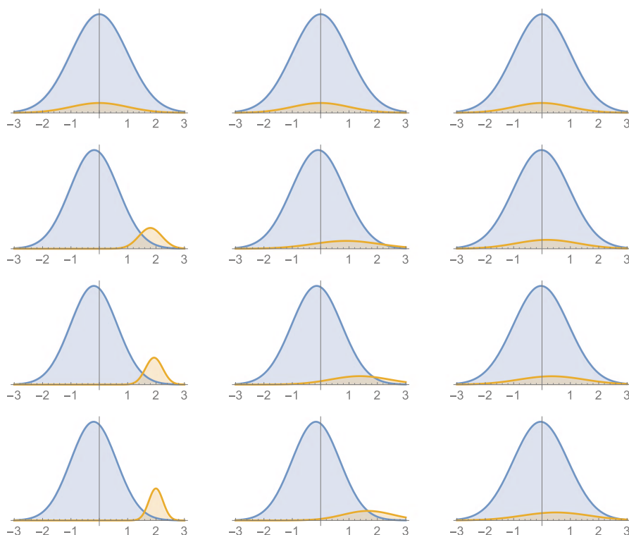
Fig. 3.3 In this model, the left group in each column is 10 times the size of the right group. The volumes of the left and right distributions reflect the difference in group size. The left, middle, and right columns show results for h equal to 1.0, 0.5, and 0.1, respectively

and create an instant (i.e., in a quarter to a half century) elite class to populate its universities and professions, with little social disruption and damage to anyone. When assortment is strong, most of the effects happen within a generation or two, at the beginning of the process, so this mechanism is an attractive target for social improvers, just as it was a century ago before eugenics went out of fashion in favor of the compelling new fad of social science.