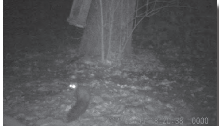
Figure 1. Stone marten ( Martesfoina ) in the garden of Institute for Wildlife Conservation where dried catnip was scattered.

The camera with dried catnip recorded one stone marten ( Martes foina ) and two domestic cats ( Felis catus ). In the first two weeks, two rubbing events by domestic cats were also observed on the hair-trap baited with valerian tincture. No other rub pads provided hits. Both of these cats rubbed the traps within one-half day after lure refreshment. For an additional two weeks, we used liquid catnip, valerian tincture and a mixture of catnip and valerian. After the 3rd