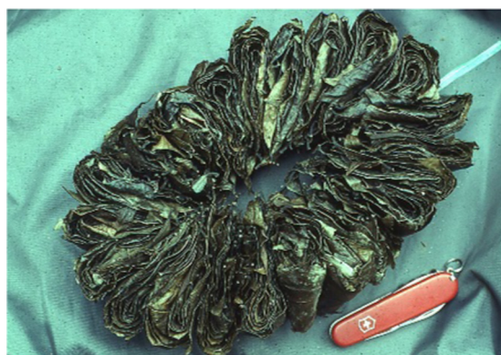
Fig. 5. Ilex guayusa (Aquifoliaceae) leaves known as wais in the Shuar and guayusa in the Runa languages.