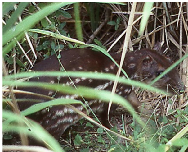
Fig. 2. Spotted paca ( Cuniculus paca ) in Ecuador.