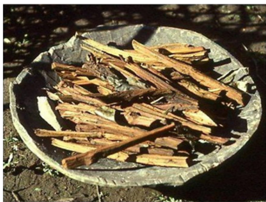
Fig. 7. Banisteriopsis caapi (Malpighiaceae), known as natem in the Shuar and ayahusca in the Runa languages, split stems.