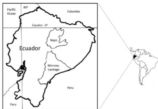
Fig. 3. Provinces of Morona-Santiago, where the Shuar, and Napo, where the Quichua, of this study reside.