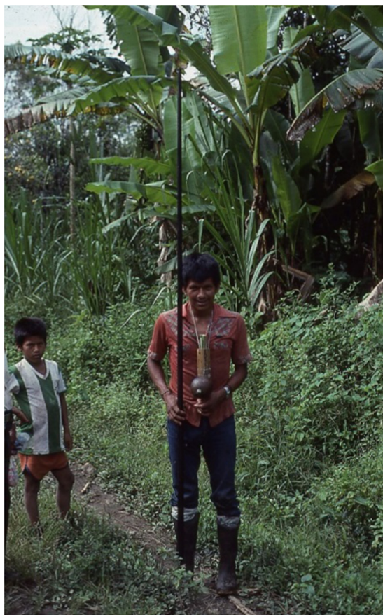
Fig. 4. Shuar hunter in Yukutais with blowgun.

Data presented here follows APG III family circumscriptions (Angiosperm Phylogeny Group, 2009). Species names follow The Plant List (2015) except as noted. Author citations are included in the text for species not cited in Tables 1 and 2. Chemical data was found using PubMed and SciFinder.