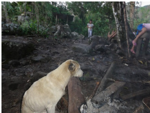
Fig. 1. Hunting dog in a Quichua village in Ecuador.