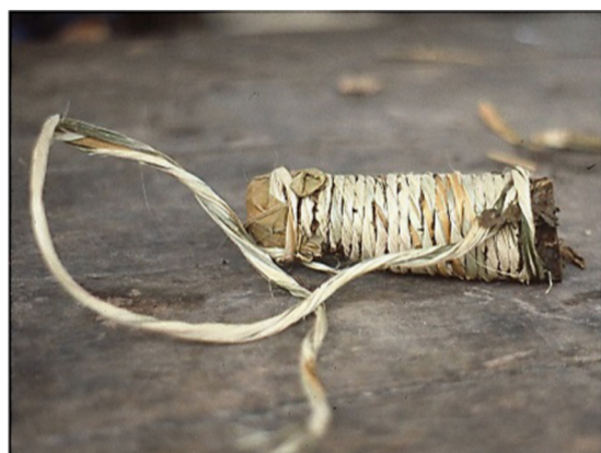
Fig. 6. Nicotiana tabacum (Solanaceae) plug used by a Quichua shaman in healing ceremonies.