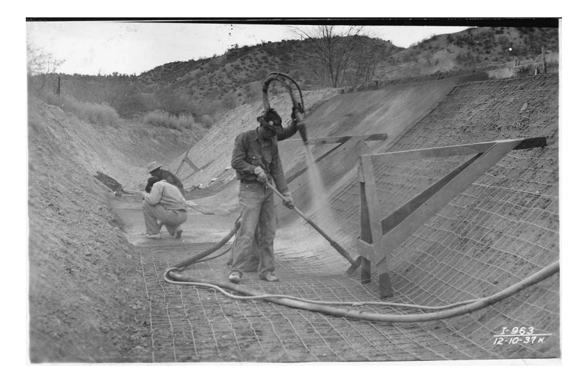
Figure 2. Though here being used to build a canal in 1937, this same method of construction would go on to be adapted for the construction of swimming pools, making them drastically cheaper and faster to build. #294602, U.S. National Archives and Record Administration.

Gunite caused the price of pools to plummet. By 1950, a sizeable 34 \times 16 ft pool could be had for just $2,000 in 1950s dollars.<sup>20</sup> This means that, when accounting for inflation, prices had been slashed by about 80% in real dollars from three decades earlier. But other factors contributed to the pool construction boom as well. Over time, technological advances for filters and chemical balancing made pools both less costly and less time-intensive to maintain.<sup>21</sup> Additionally, the 1950s brought about the reclassification of pools as 'home improvements', meaning they were eligible for bank financing for the first time. This helped open the floodgates, letting more people purchase pools than just those that could pay up front in full. By 1958, 'more than two-thirds of all residential pools built in the United States were financed through banks or mortgage and loan companies.<sup>22</sup> One 1961 Times article, citing the National Swimming Pool Institute, claimed that Californians could buy pools for three quarters the price paid by the rest of the country, as the competitive market depressed prices. Builders could keep their own costs down, too, as the mild winters meant pool walls didn't need to be as thick as they did in the North and East parts of the country. The article explained that as a result, over a third of the nation's 290,000 pools were in-state. <sup>23</sup>