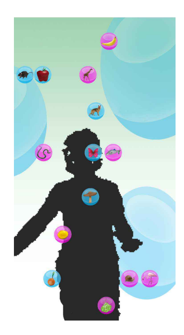
Figure 2: A user is interacting with the soap bubble game.