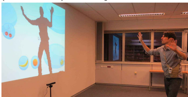
Figure 1: A user is interacting with the system perceiving EMS feedback.

Institute for Visualization and Interactive Systems University of Stuttgart {firstname.lastname}@vis.uni-stuttgart.de