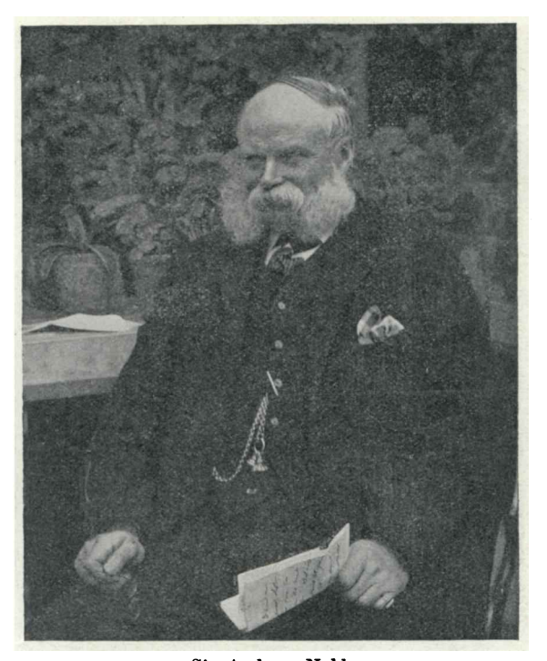
Sir Andrew Noble.

his grounds what I think was the first hydro-electric installation in this country and the first transmission of considerable quantities of electric energy over a fairly long distance.