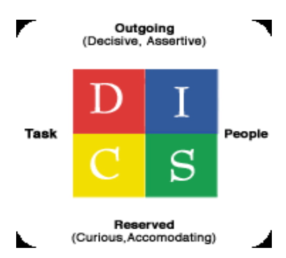
Figure 1: The DISC model axes alignment, retrieved from www.profilesglobal.com, 2009.

These four axes provide the name of the DISC model, and the information derived refers to the use of the DISC instrument in predicting personality. The physical alignment of these axes is illustrated in Figure 1.