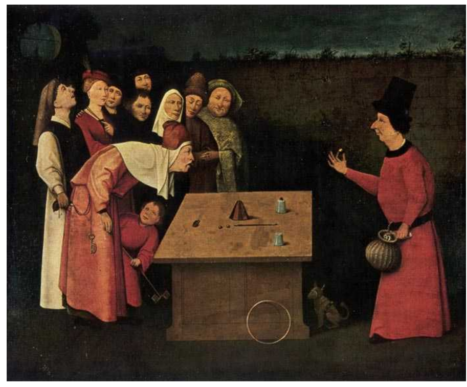
Figure 1 | The Conjurer, by Hieronymus Bosch. A magician performs for the crowd in medieval Europe, while pickpockets steal the spectators' belongings. The painting is in the Musée Municipal in St.-Germain-en-Laye, France.

(or Rubber Tree) illusion<sup>8</sup>, in which an oscillating bar (or rubber tree) seems to bend when it is bounced rapidly. The neural basis of this illusion lies in the fact that end-stopped neurons (that is, neurons that respond both to motion and to the terminations of a stimulus' edges, such as corners or the ends of lines) in the primary visual cortex (area V1) and the middle temporal visual area (area MT, also known as area V5) respond differently from non-end-stopped neurons to oscillating stimuli<sup>8-11</sup>. This differential response results in an apparent spatial mislocalization between the ends of a stimulus and its centre, making a solid object look like it flexes in the middle.