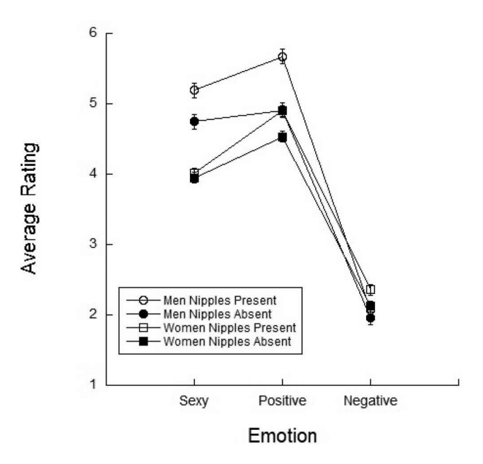
Figure 1. Average rating for the three emotion composites (sexy, positive, and negative) for the men (circles) and women (squares) for the stimuli with erect nipples (open symbols) and without erect nipples (closed symbols).

The significant three-way interaction between emotion, nipple presence, and gender, F(2, 870) = 31.95, p < .001, all \eta_p^2 = .068 , is shown in Figure 1. Examination of the figure suggests that men viewed the stimuli as more