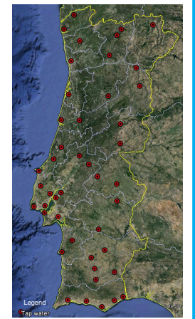
Figure 1 – Location in Portuguese mainland of the tap water sampling sites.

Mortality rate from suicide (intentional selfharm: ICD-10 codes X60-X84) for the period 2008-2011 was collected at Instituto Nacional de Estatística [4].