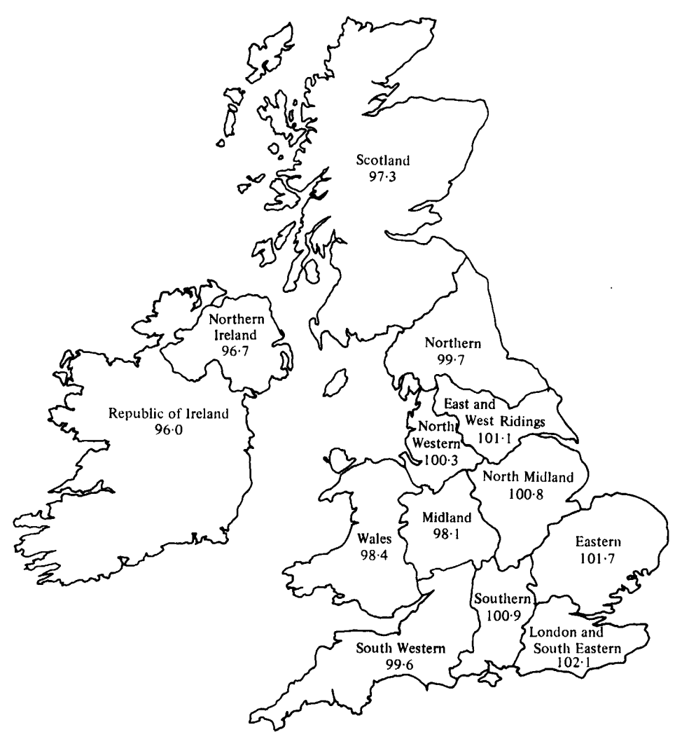
Figure 1. Standard regions of England, Wales, Scotland and Ireland showing mean population IQs.

population of Dublin. The mean IQ of this sample was 88. The third major study of intelligence in the Irish Republic has been carried out by Byrt & Gill (1973, 1975). This involved the standardization of Raven's Standard Progressive Matrices on 3466 Irish children aged 6 to 13 drawn as a representative sample of the population from the whole of the country. The means were transformed into IQs based on British means of 100, and in all age groups the Irish children scored a little below the British. The overall mean difference is reported as approximately three IQ points, yielding a mean Irish IQ of 97. The difference between this and the British mean is statistically significant although comparatively small. Examination of the data reveals a small source of error, namely that the Irish samples were approximately 2 months older than the British standardization samples. This has led to a slight overestimation of the mean Irish IQ. Correction of the result for this error reduces the mean Irish IQ by approximately one point, giving a mean IQ of approximately 96.