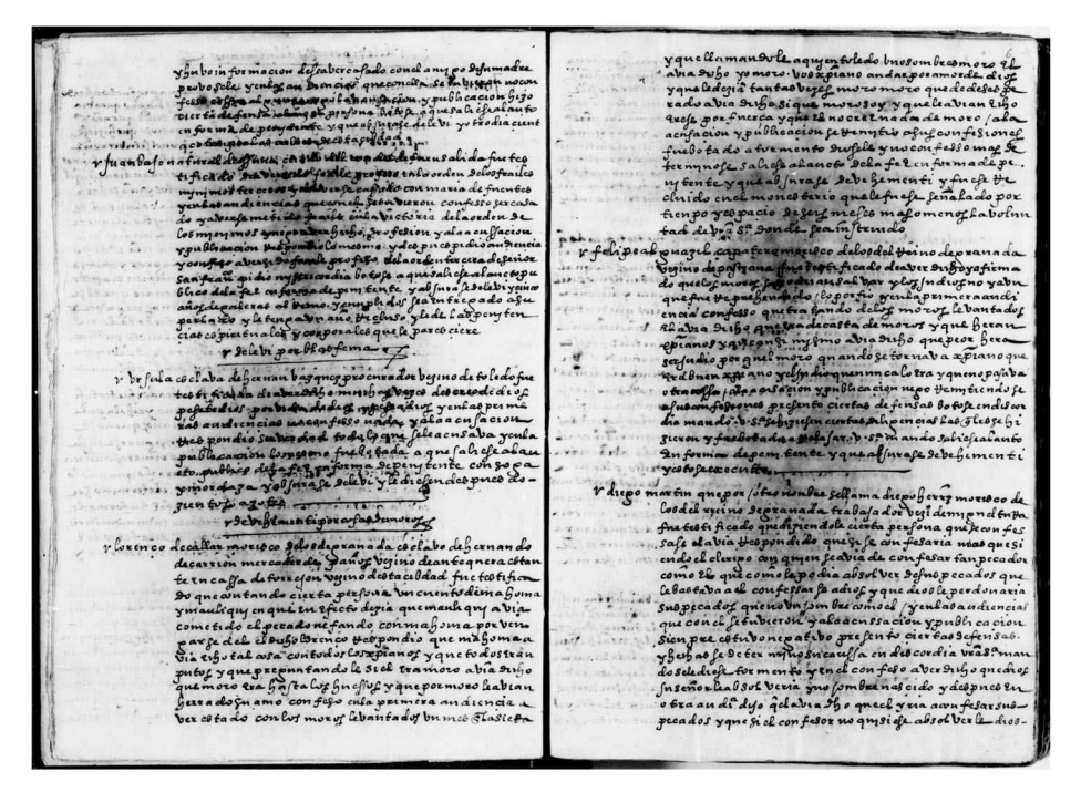
Figure 1. An excerpt from the Halle manuscript, MSS Yc 2° 20 (1), showing page 5 verso and page 6 recto. These two pages display summaries of the 1575 trials of Juan Bajo, the slave Ursula, Lorenzo de Collar, Felipe Alguazil, and Diego Martin. Collar and Martin were tortured.

accused, the charges, a summary of remarkable trial highlights (irregularities regarding witnesses, whether and when the accused confessed, whether the accused was tortured and with what results), and the verdict (Figure 1).