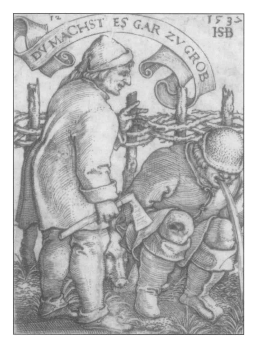
Fig. 4. Repulsive behavior projected on the caricature of a farmer, by Hans Sebald Beham, 1537. The text says: "You are behaving very rude indeed."