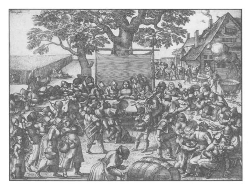
Fig. 3. This country wedding by Petrus van der Borcht in 1560 presents a "catalogue" of despicable behavior, from vomiting, below right, to relieving oneself, above left.

frequent defecation is often attributed to characters who were very much feared. The most obvious example is perhaps the way in which the devil was represented on the medieval stage. He was repeatedly represented rolling about in his own dirt and often announces his presence by loud farting and a loathsome stench. In the visual arts he is not infrequently represented as a farting monster. The reason for this characterization is not that the devil was ridiculous to a medieval audience: just the opposite. It was the truly awesome nature of his power that necessitated his degradation. Ridicule was the means by which this power could be circumscribed and controlled. Similar strategies are found in the ways in which the medieval public dealt with death, the inquisition, and sexuality. These powerful forces were dealt with by means of the very human weapons of excrement and pornography.<sup>12</sup>