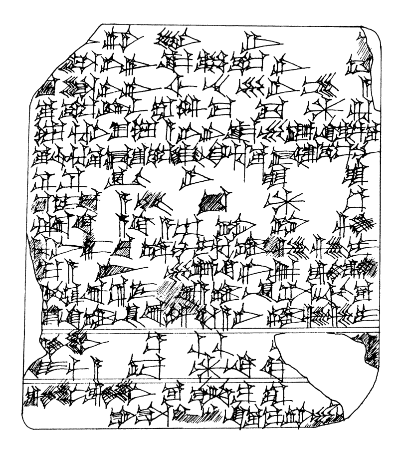
Fig. 1a: N 1237, obv.