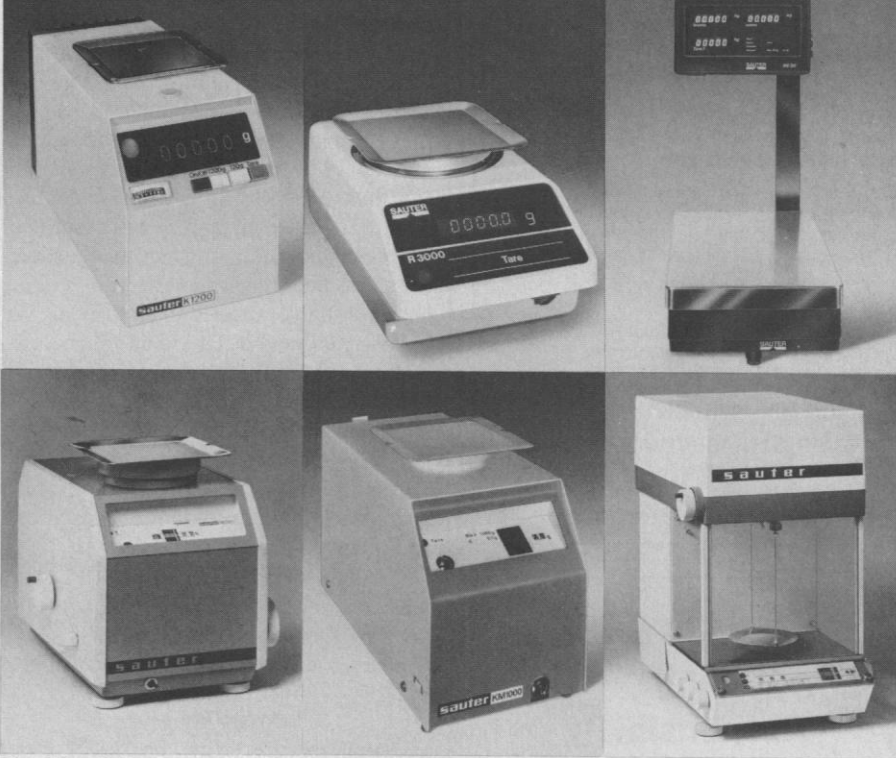
Precision Balance, Type SM 1600

Electronic Precision Balance, Electronic Precision Balance, Electronic Precision Balance,