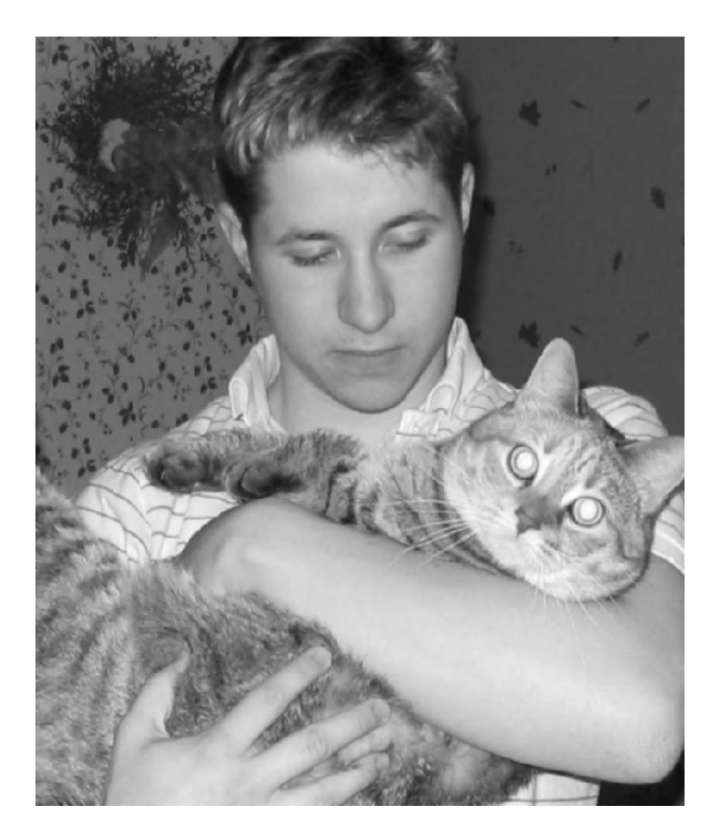
Figure 1. Cats may be favoured as companion animals because of their soft fur, relatively small size, and the willingness of most of them to be held, petted and cuddled by humans.

difficulties of definition, cross-species comparisons, and differences in methodology.