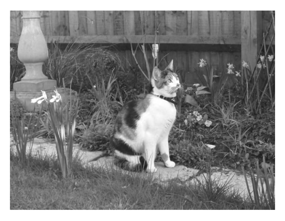
Figure 3 . In the United States, cats have traditionally been allowed to roam free at their will, but in the last decade this practice has changed; more and more cats are being confined indoors..

This combination of issues and concerns seems to be having an impact on owners, at least in the United States. In a preliminary study of 256 households surveyed from 1993 to 2003, Bernstein (2001, 2003) found that 50% of 503 cats were being kept indoors at all times. Of those allowed outdoors, only 33% were unrestricted (about 17% of all cats); an additional 15% (7% of all cats) had restricted outdoor access, such as sitting with their owners on a house deck, being walked on leashes, being restricted to a lead in the yard, or only allowed into small fenced-in areas in the yard. Interestingly, at least some cats restricted themselves, either showing no interest in going out when offered, or acting fearful and running away when the possibility was presented. Owners of declawed cats were equally likely to let their cats out as keep them in. These findings are in sharp contrast to the figures recently released by the Feline Advisory Bureau (2004, and at www.fabcats.org) from a survey of 1853 British cat owners: in this group, 75% of cats were allowed out at will during daylight hours.