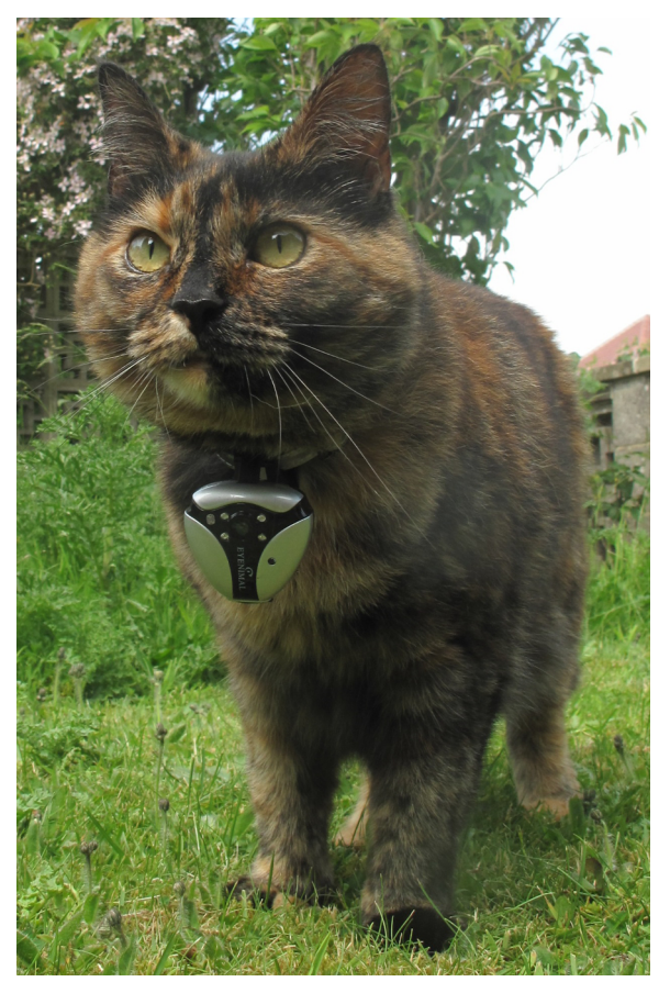
Fig. 1. Cat 'Treacle' wearing a cat-camera.

through behind the LED bulbs. These cameras also record sounds, enabling researchers to record cat vocalisations.