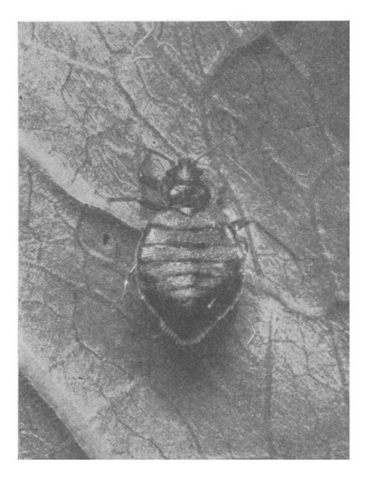
FIG. 1.-Live adult bedbug trapped on bean leaf. Note abnormal position of legs. ×10.

After preliminary studies a series of 7 tests were made, in which 24 to 273 bedbugs (average 110) were confined in