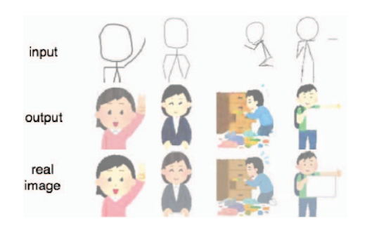
Fig. 4. Results of image generation with the proposed architecture at the last epoch: input images of stick figures ( upper row ), generated images of the character figures ( middle row ), and true images of the characters figures ( lower row ).

The input images, that is stick figures, the generated images, and the real images of Stage II at the last epoch are shown in Fig. 4. As can be obserbed, the details such as the facial parts are generated without blurring in contrast to the pix2pix-based architecture. Moreover, there are some desirable differences between the generated images and the real images: some details such as the face colors are different. Overall, the generated images of the proposed architecture are improved as compared to those of the pix2pix-based architecture.