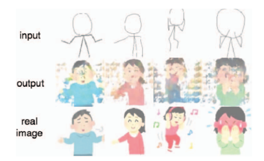
Fig. 2. Results of image generations with the pix2pix-based architecture at the last epoch.

In the earlier stage, the loss for the generator quickly drops to approximately 7.5. This implies that the generator is able to generate images that are similar to the real images in terms of MAE. However, after that, the green line gradually goes up and then down. Finally, the loss ends at a value approximately 7.5, which is almost the as the value at around the 40th epoch. Furthermore, as represented by the blue line, the loss for the discriminator gradually becomes very low until approximately the 200th epoch. After that, although it increases slightly, it remains low. This low loss indicates that the discriminator distinguishes the generated images from the real images fairly accurately. These facts indicate that the losses of the generated images are still dominated by the MAE instead of the discriminator's loss. Consequently, the generated images are not affected so much by the adversarial framework of GANs.