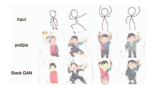
Fig. 5. Comparison of pix2pix-based and the proposed architectures for rare poses.

The ability to generate details is improved by the proposed architecture as compared with the pix2pix-based architecture. As both the structures of the GANs in Stage 1 and Stage 2 are almost the same as the pix2pix-based model, this improvement is the effect of constructing two-stage GANs. A rough image is generated at the first stage and a fine image was drawn in the second stage. We drew new stick figures that have rare poses such as the upper row of Fig. 5 manually and input the learned generator. The images generated by the models at the the 400th epoch are shown in the middle row and the lower row of Fig. 5, respectively. As shown in Fig. 5, rare poses such those involving bent knees and raised hands could not be successfully generated. There is room for improvement through the use of some contrivances such as making datasets more diverse and learning for a longer period in order to make the adversarial learning more robust.