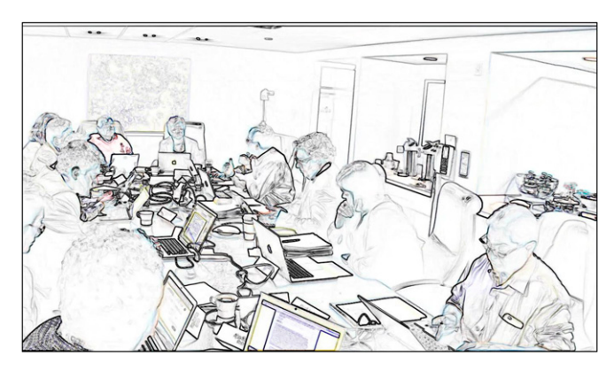
Fig. 1. Deidentified image from one of four peer-review panel meetings.

funding recommendations to the director of the NIH institute or center that awards the funding. Reviewers in study sections are prohibited from discussing or considering issues related to funding and instead are encouraged to rate each application based on its scientific merit alone.