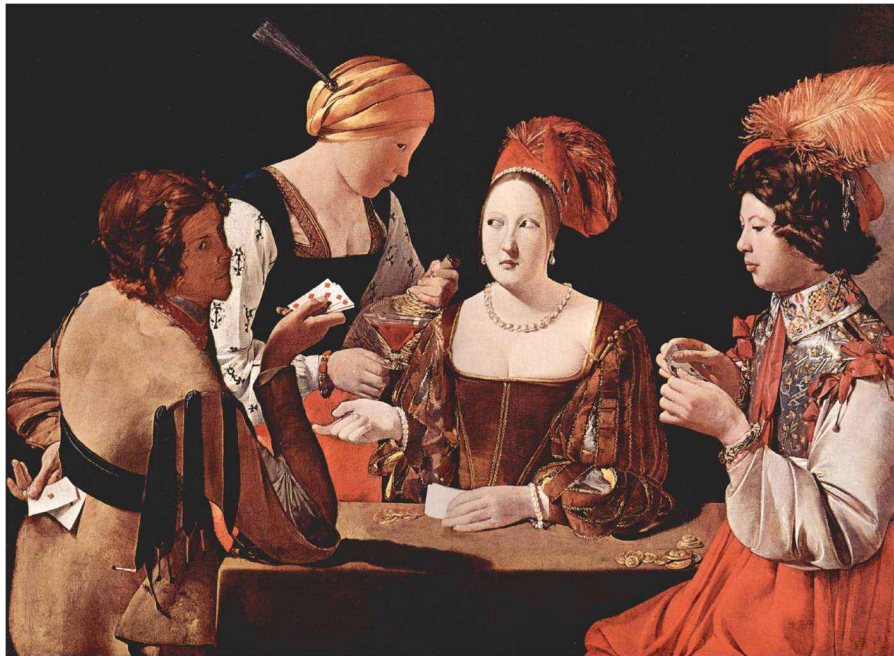
Figure 2. Georges de la Tour's circa 1635 painting "Le Tricheur" (or "The Cheat"). The painting currently exists in two versions. This version (also known as "The Ace of Diamonds") is in the Louvre. The online version of this figure is in color.

was a hope for a Robust New World on a scale that would displace most of classical statistics, now there was no audible voicing of such a hope. The euphoria of the first decade proved to be unsustainable. Reasons for this change were not hard to find. Indeed, some were noted in the discussion of Bickel (1976), and many of them were summarized in a new chapter Peter Huber himself added to the 1996 second edition of his 1977 SIAM monograph. As models grew more complicated, so too did the question of just what "robust" meant. The potential model failures in a multivariate time series model are huge, with no consensus upon where to start. Even in such cases, important progress was made, but with lower expectations of completeness. The crisp formulation and brilliant solutions for the location parameter problem were not to be repeated. The Neyman–Pearson Lemma extends effortlessly to Banach and Hilbert spaces; Huber's (1964) result was not available for the more complex worlds that modern statisticians live in.