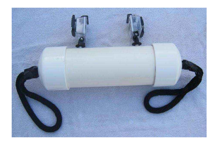
Figure 2. Cooperative problem-solving apparatus.

The problem-solving apparatus was a 43 cm long PVC pipe sealed on both ends with a cap, one of which was removable (see Figure 2). From each cap, a loop of soft, black rope protruded to allow the dolphins to grip the caps of the apparatus and pull them to open the device. The inside contained herring or capelin fish and ice as the food reward for opening the apparatus. Two GoPro Hero3 cameras were fitted to the apparatus. One GoPro Hero5 underwater and a Sony camcorder above water were used to record the sessions for coding purposes.