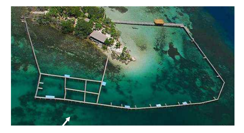
Figure 1. An aerial view of Bailey's Key. Arrow points to testing enclosures.<sup>1</sup>