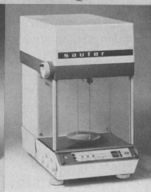
Analytical Balance, Type 404/13

SAUTER balances have earned a reputation for ease of operation, economy and practical technology. No wonder SAUTER balances are the choice in research and development laboratories, in industry and scientific institutions just about everywhere.