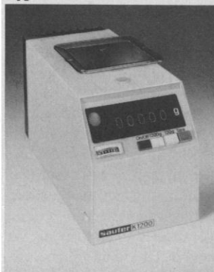
Electronic Precision Balance, Type K 1200