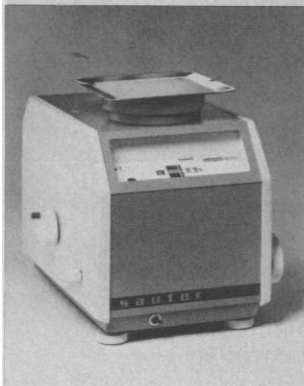
Precision Balance, Type SM 1600