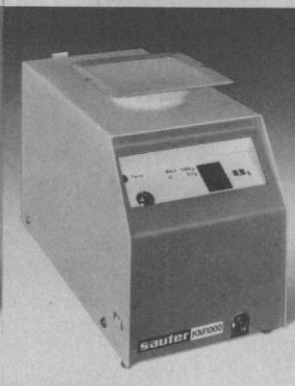
Precision Balance, Type KM 200/KM 1000