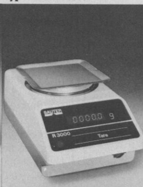
Electronic Precision Balance, Type R 300/R 3000