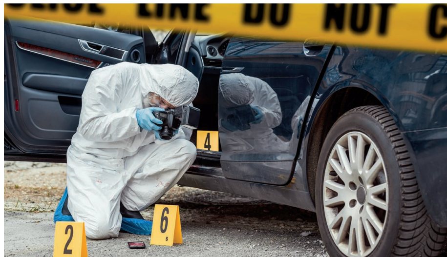
Traces of DNA from items at a crime scene can predict a person’s hair, eye, and skin color—and more, some say.