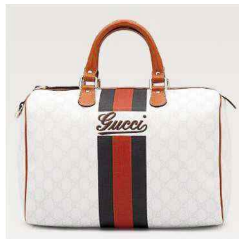
Gucci Handbag No. 120 Average Loudness Rating =7 Price: $640