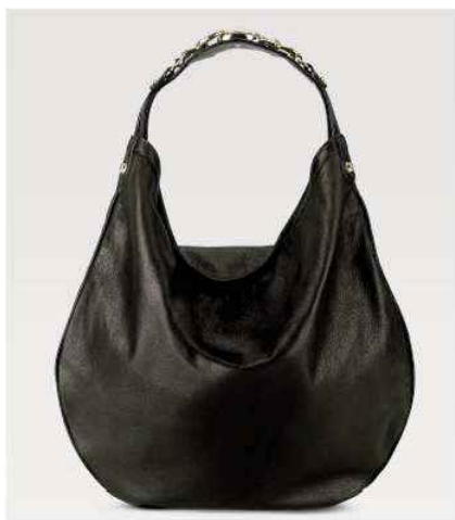
Gucci Handbag No. 170 Average Loudness Rating =1 Price: $1,150