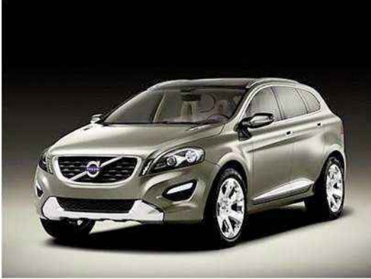
FIGURE 1 Volvo XC60 and Volvo XC90