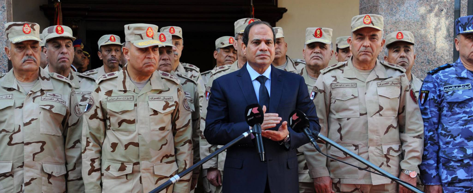
The taghut Sisi and his murtadd forces are allies of the belligerent Christians

Answer: The prevailing trend in many people’s reactions is that of denunciation, as well as disassociation from these operations in specific, and from the war on the Christians and the tawaghit in general, and of offering condolences to these mushrikin on account of what befalls them, under the claim of national brotherhood and the likes, despite that being a show of allegiance to the kuffar and mushrikin, which takes one out of the religion. Whoever does any of that becomes an apostate from the religion of Islam, and his deeds are nullified as long as he does not hasten to repent and show regret before there comes from Allah a day (i.e. the Day of Judgment) which cannot be repelled.