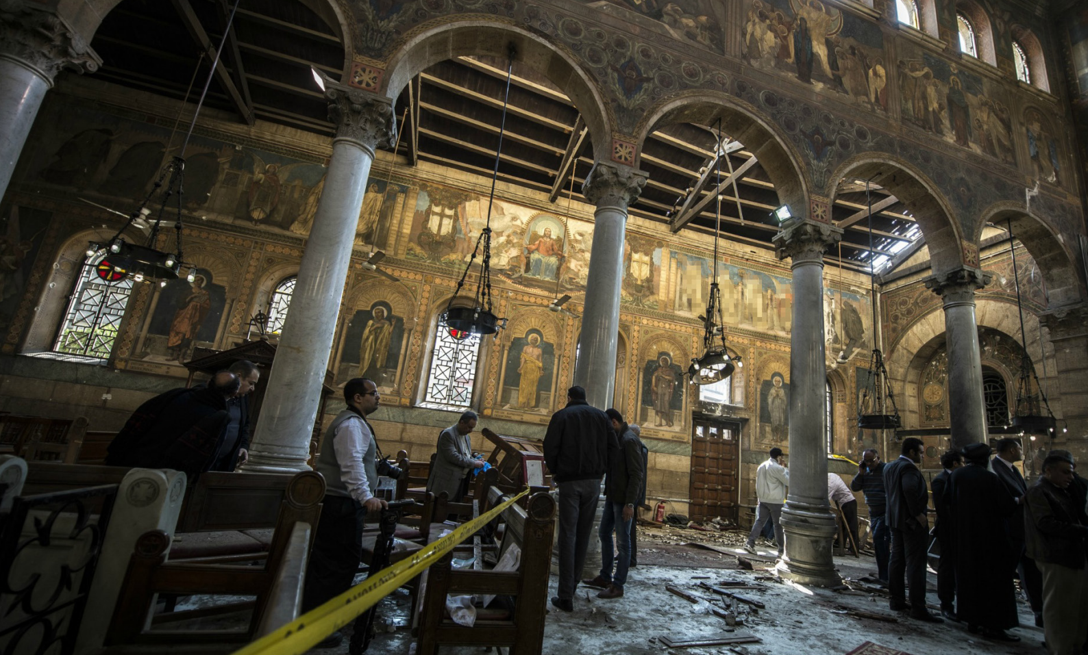
The aftermath of an attack on the belligerent Christians of Misr

indeed its fragrance can be found from a distance of 40 years of marching” (Reported by al-Bukhari), and in the narration of Ahmad and others, “Whoever kills someone from Ahl adh-Dhimmah...” Likewise, there is the statement of ‘Umar Ibn al-Khattab ؓ, “And I counsel you concerning the dhimmah of Allah and the dhimmah of His Messenger ﷺ – that the covenant with them is upheld, that they are defended against the enemy (i.e. the belligerent kuffar), and that they are not burdened with more than they can bear” (Reported al-Bukhari).