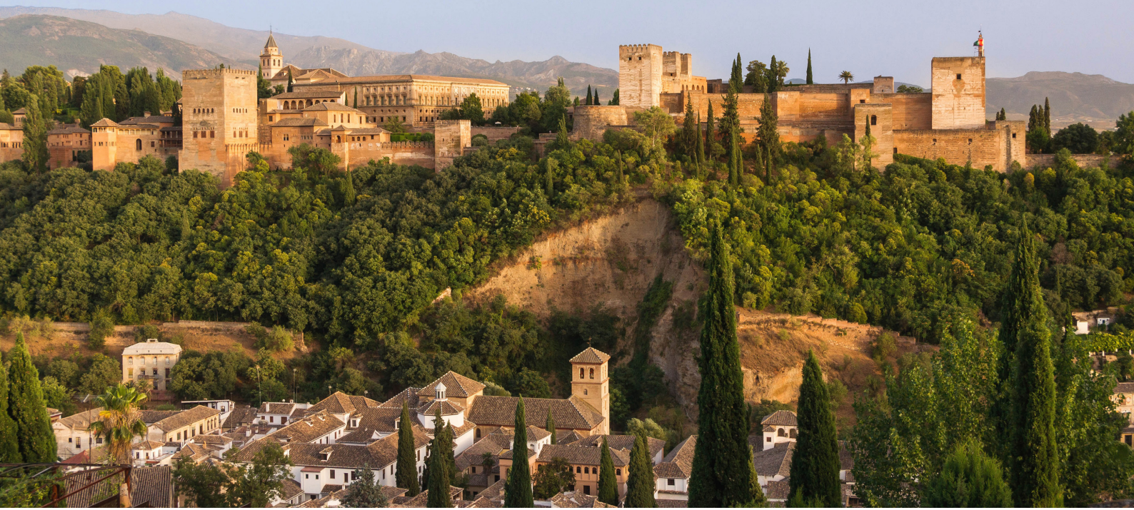
Alhambra, a Muslim fortress in Andalus that fell to the kuffar after the Muslims became divided

one can overcome you; but if He should forsake you, who is there that can aid you after Him? And upon Allah let the believers rely” (Al’Imran 160).