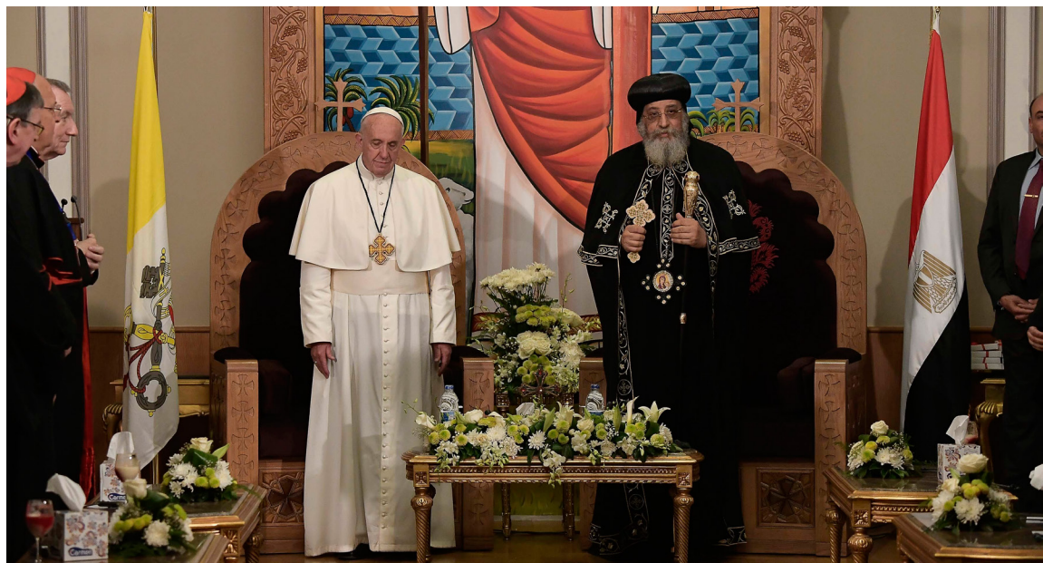
The Christians of the East and the West will be fought until they give jizyah

Question: What is the goal you wish to achieve by targeting the churches?