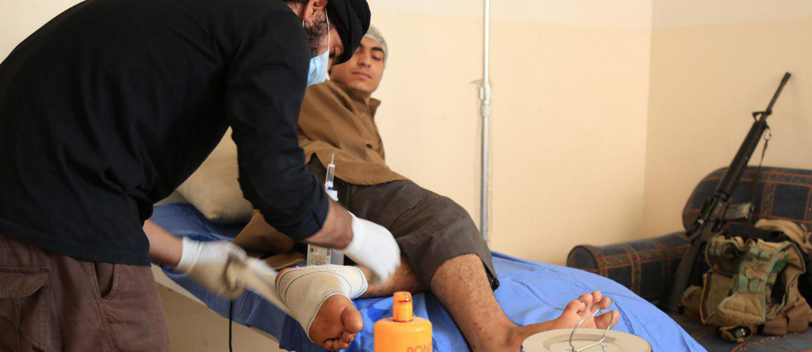
The mujahid for Allah's cause is often tested with injury in battle

jihād will continue as a constant factor on the earth, as he said, “There will not cease to be a group from my ummah, standing by the command of Allah – not harmed by those who betray them or oppose them – until Allah’s command comes and they are as such” (Reported by al-Bukhari and Muslim from Mu’awiyah).