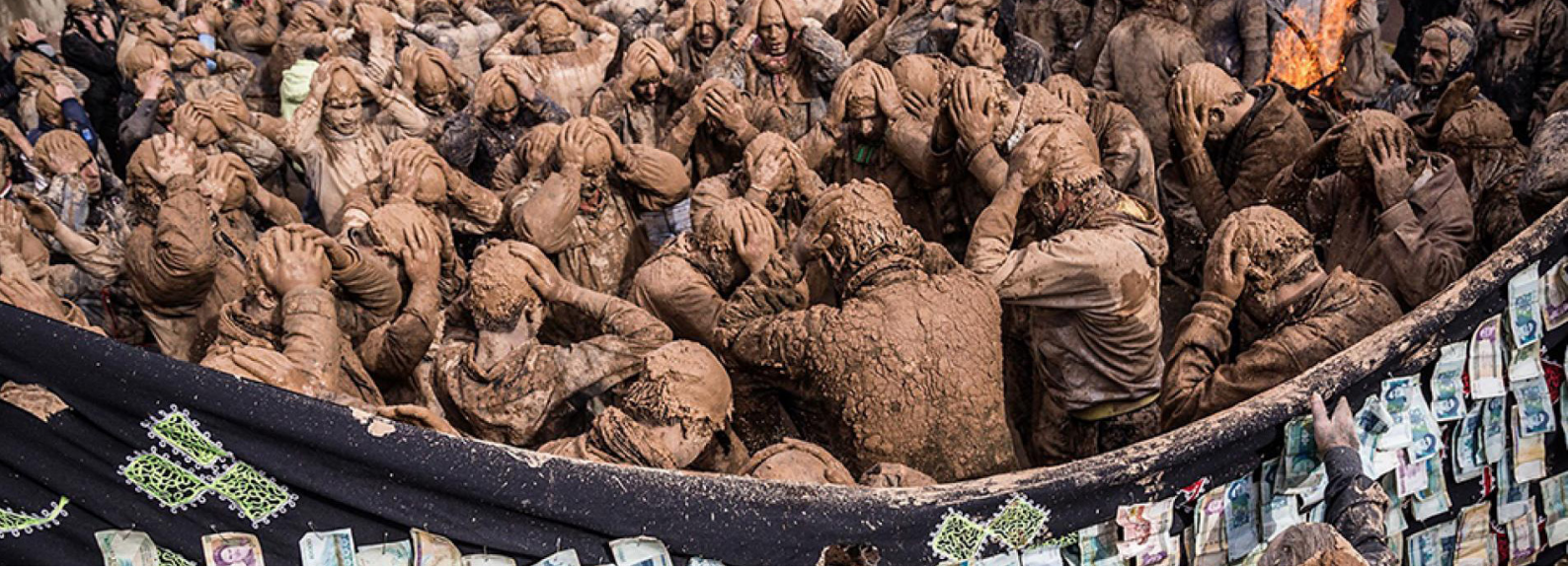
Rafidi swine wallowing in the mud

peer or equal, and that whoever disputes him in any of that is a taghut, just as whoever gives to his opponent that which should be for the imam has committed shirk with Allah ﷻ!