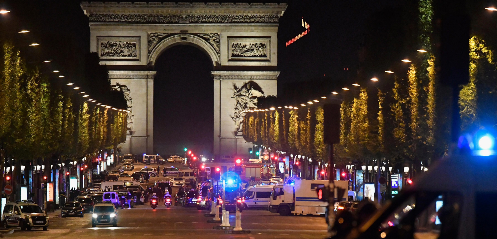
The aftermath of the attack in Paris