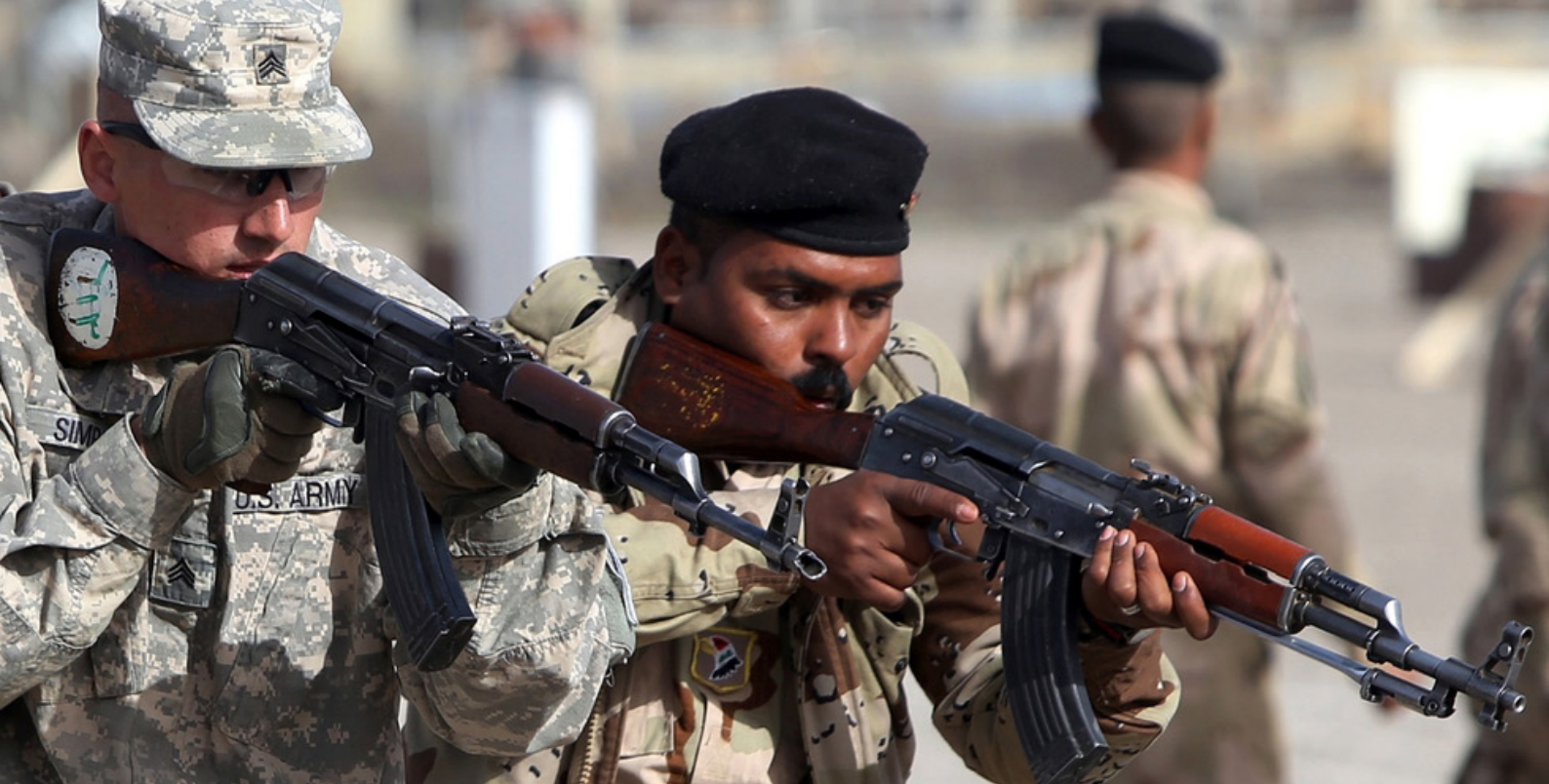
The murtaddin sold their religion to become servants of the Cross

of reward or ghanimah.’ By the One in whose hand is the soul of Muhammad, there is no injury sustained in the cause of Allah, except that it comes on the Day of Judgment in its form when it was sustained: its color will be the color of blood, but its scent will be that of musk. By the One in whose hand is the soul of Muhammad, if it were not a hardship upon the Muslims, I would have never remained behind from a detachment that went to battle in Allah’s cause. But I do not find the provision enough to carry [all of those who would come with me], nor do they find provision enough, and it would be a hardship on them to be away from me. And by the One in whose hand is the soul of Muhammad, I would have loved to fight in the cause of Allah and be killed, then fight and be killed, then fight and be killed” (Reported by Muslim from Abu Hurayrah).