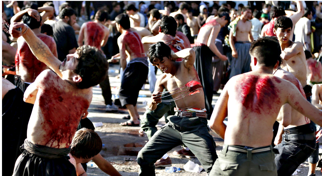
The Rafidah are a disease which cannot be cured except with the sword

ing that he had returned to life after his death, thus declaring that their imam Ja’far – whom they refer to as as-Sadiq (the truthful) – was a liar when he told them that his son had died. Rather, they claim that he made up the story of his son’s death due to taqiyyah (concealing the truth out of fear), in order to protect him from his enemies, and that he was really just in hiding. From these heretics came the esoteric Isma’ili sect, which continues today and whose followers claim to have kept the imamah intact within the lineage of Isma’il Ibn Ja’far. And from them came the heresy of believing in the ghaybah (prolonged absence), perpetual life in the Dunya, and the reincarnation of their imams.