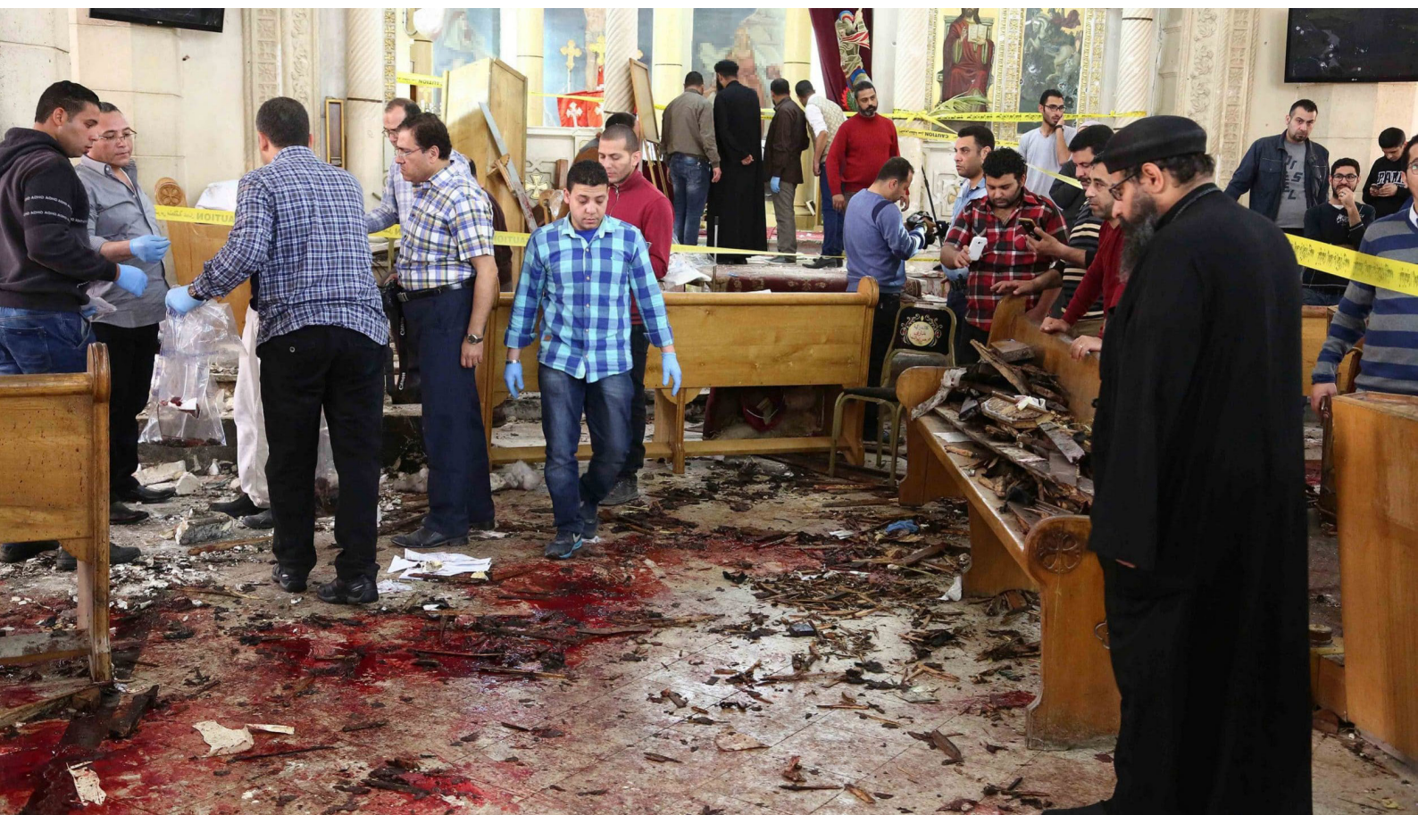
The belligerent Christians of Misr are a target for the mujahidin

Imam Ibn Taymiyyah رحمه الله said, “The monks concerning whom the scholars differed as to the permissibility of killing them and taking jizyah from them are mentioned in the hadith from Abu Bakr as-Siddiq رضي الله عنه , who stated in his orders to Yazid Ibn Abi Sufyan when sending him to lead the conquest of Sham, ‘You will find a people who claim that they have secluded themselves in their monasteries, so leave them and their claim to have secluded themselves for Allah, and you will find a people who have sheared the hair from the middle of their heads, so strike the place where they’ve sheared their hair with the sword, because Allah says, ‘Then fight the leaders of kufr, for indeed, they have no covenant; [fight them that] they might cease’ (At-Tawbah 12). As for the monk who aids the people of his religion with his hand and his tongue, such as one who has an opinion which they seek when