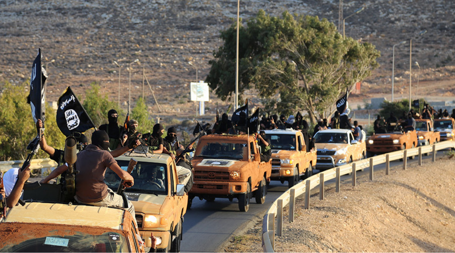
Allah opened the lands to the mujahidin

day you abandon the Kurdish atheists and Sahwah apostates in Sham, so that they meet the same fate as their predecessors in Iraq, by Allah's permission.