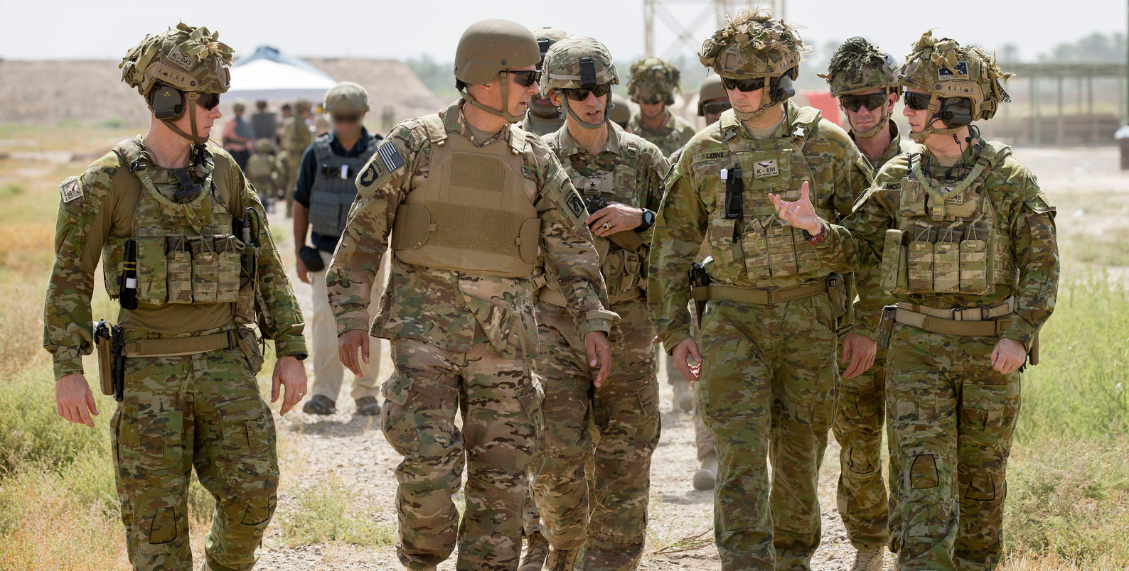
America continues on its arrogant path after many years of spending, fatigue, and misery