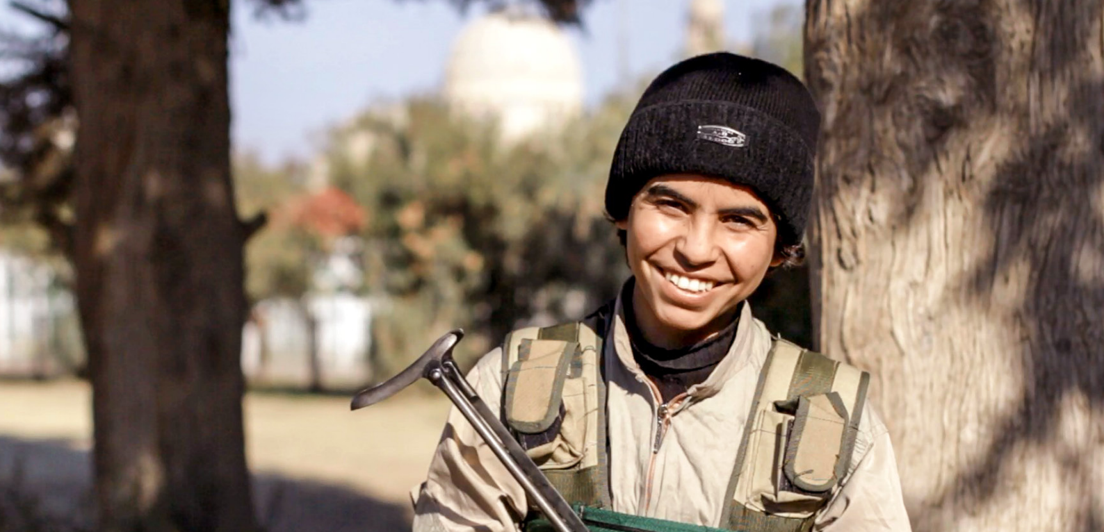
A soldier of the Khilafah who was incited to wage jihad by his mother

lim). Ibn Hajar said, “Nourishing,’ meaning: Suffice them with as much nourishment as will neither burdensomely force them into the humiliation of begging nor contain such excess as to provoke them towards luxury and towards widening the extent to which they engage themselves in the Dunya” (Fath al-Bari).