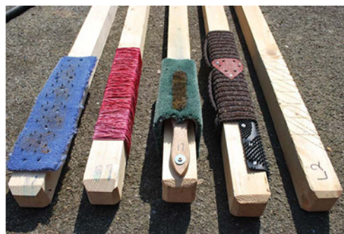
Fig. 1 The tested hair snares (left to right): carpet, rubber band, wire brush, doormat, and wildcat

The “wire brush hair snare” consisted of a new wire brush with four rows of brass wire, with the brush head surrounded by a 30-cm-wide piece of high-pile (8 mm)