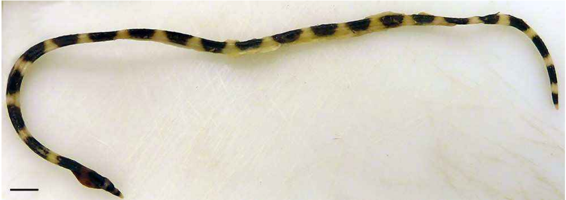
FIG. 4. Fresh dorsal image of Leiuranus semicinctus from Wahoo, Acanthocybium solandri . Specimen not retained, ca. 285 mm TL, east of Cairns, Qld. Image by M. Zischke. Scale bar = 1 cm.

coincident with the study on P. diacanthus , a similar study was undertaken on a number of other fish species (families Lutjanidae and Lethrinidae) from the same collection locations; only one Lutjanus johnii out of 1200 specimens of mixed species examined, all predatory, but not specifically benthic, were found to have encased eels (Barton, unpub. data), although the eel genus could not be identified. A second benthic snapper species, Lutjanus erythropterus , was recently found with an encased eel, genus Yirrkala from the North West Shelf, WA. Other host families encountered during this study (Platycephalidae, Polyprionidae, Serranidae) are primarily benthic to benthopelagic in nature, although some (e.g. Centrolophidae, Scombridae) can also be associated with seamounts and drop-offs and have pelagic aspects to their behaviour, likely driven by diurnal and /or nocturnal vertical migrations for feeding. It is difficult to know if all the eels were taken near the benthos as there are also some pelagic members of the Ophichthidae, including Neenchelys Bamber, 1915 (Ho et al. 2015), but some eels were unidentifiable either due to poor condition or not being retained.