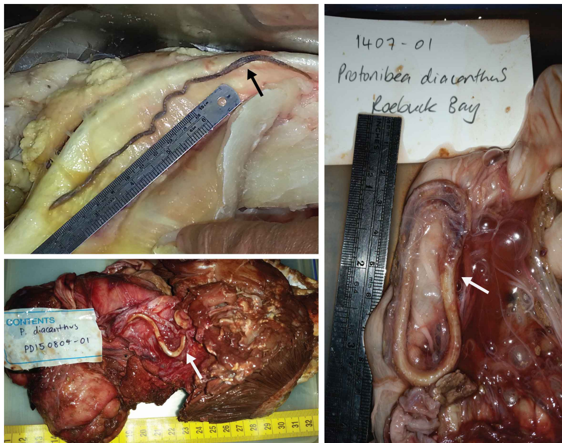
FIG. 1. Unidentified snake eels (Family Ophichthidae) found in the body cavity of Protonibea diacanthus in northern Australia. Arrows point to the specimen. Top left, NTM S. 17726-001 from Adelaide River, NT; bottom left and right - from Roebuck Bay, WA.

DNA analysis of eight specimens of snake eel in comparison to sequences on BOLD confirmed the presence of four different species. Despite successful sequencing, none of the specimens collected in this study were an exact (100%) pairwise match to a known species in the BOLD database.