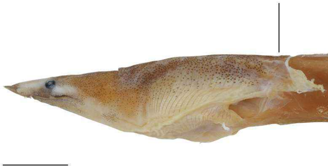
FIG. 3. Preserved lateral head image of Yirrkala cf. chaselingi (CSIRO H 8292-27, 355 mm TL, North of Cape Lambert, WA) removed from Crimson Snapper, Lutjanus erythropterus . Vertical bar denotes location of dorsal fin origin. Scale bar = 0.5 mm.

teleost species in three different families (J. Rowley, personal communication to JWJ). These additional teleosts include what was previously and colloquially known as ‘bar cod’ (now known to consist of Banded Rockcod Hyporthodus ergastularius (Whitley 1930) and Eightbar Grouper, Hyporthodus octofasciatus (Griffin 1926), family Serranidae), Hapuku ( Polyprion oxygeneios (Schneider & Forster 1801), family Polyprionidae) and Blue-eye Trevalla ( Hyperoglyphe antarctica (Carmichael 1819), family Centrolophidae).