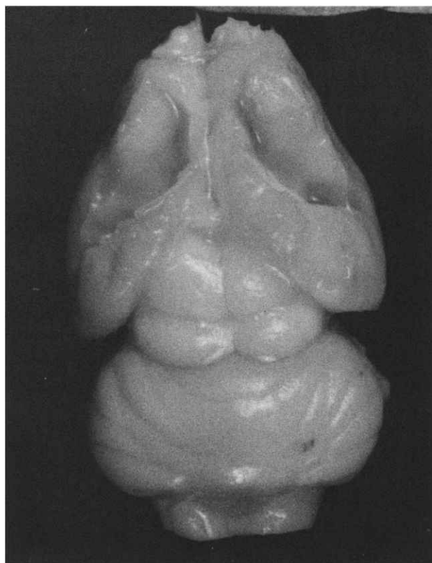
FIG. 1. Photograph of a representative neonatally decorticate rat.

For testing, each female was placed in a 77×40 cm solid walled box divided along its width into two approximately square chambers. The solid barrier between these chambers contained a small opening through which the (smaller) female, but not the male, could easily pass. Each female was initially placed either in the side containing a sexually vigorous male or on the other (empty) side. After a 6 min test the female was removed for approximately 2 min and then rein-