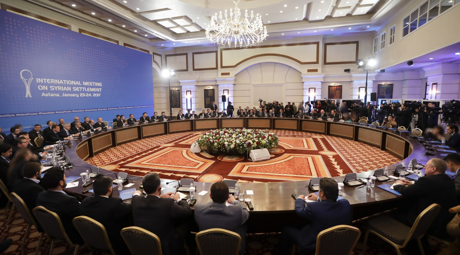
The Astana conference

standing alongside America – whom they had fought for years – in order to confront their common enemy, the Islamic State, would push America to fulfill its promise of handing the rule of the land over to them after they withdraw from Iraq, which would occur as soon as they'd eliminated the Islamic State. And of course, America didn't fulfill any of its promises, and their fate was that they were wiped out at the hands of the Rafidi militias, which donned the uniforms of the police and the military after the Sahwat had spared them the hardship of having to fight the Islamic State and left them to take Iraq as easy ghanimah. But Allah was kind to the Muslims and the Islamic State returned in a number of years, afflicting the Rafidah and their brothers – the Sahwat – with the worst of torment, and rescuing – by Allah's grace – the lands and the people under their control.