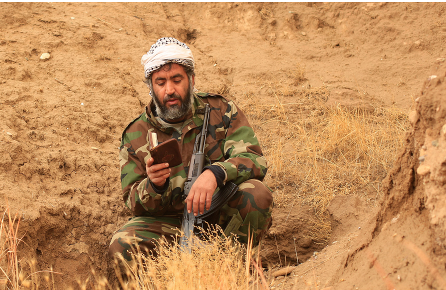
Dhikr is essential in jihad, and the greatest dhikr is the Quran

In conclusion, I give a reminder of His عز وجل saying, "O you who believe! Persevere, endure, remain stationed (in ribat), and fear Allah that you may be successful" (Al 'Imran 200), and, "Rely on Allah, if you are believers" (Al-Maidah 23), and, "Indeed, Allah is with those who fear Him and those who are doers of good" (An-Nahl 128), and, "Allah will surely support those who support Him. Indeed, Allah is Powerful and Exalted in Might" (Al-Hajj 40), and, "O you who believe! When you encounter a company [of the enemy], stand firm and remember Allah much that you may be successful" (Al-Anfal 45), for these are the paths to victory found in the Book of Allah, so hold tightly to them.