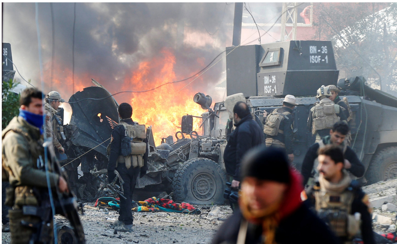
The mujahidin continue to pursue and punish the kuffar

But with everything they sacrifice for the cause of Allah, the muwahhidin hope to attain nearness to Him ﷻ, and to draw more of the victory which He grants to His slaves when He sees the truthfulness of their jihad. And even as they seek victory against their enemies, they know with certainty that there is even greater reward for them if they are defeated in war after having purified their intentions and exerted their efforts, as the Prophet ﷺ said, "No fighter or detachment carries out a raid, takes ghanimah, and returns safely except that they have received two thirds of their rewards, and no fighter or detachment fails to acquire ghanimah and is afflicted except that their rewards will be given in full" (Reported by Muslim). So after every defeat, they make more sacrifices for the sake of pleasing the Lord of the heavens and the earth, until the religion becomes entirely for Allah or they perish in the process, just as their Lord ﷻ described them in