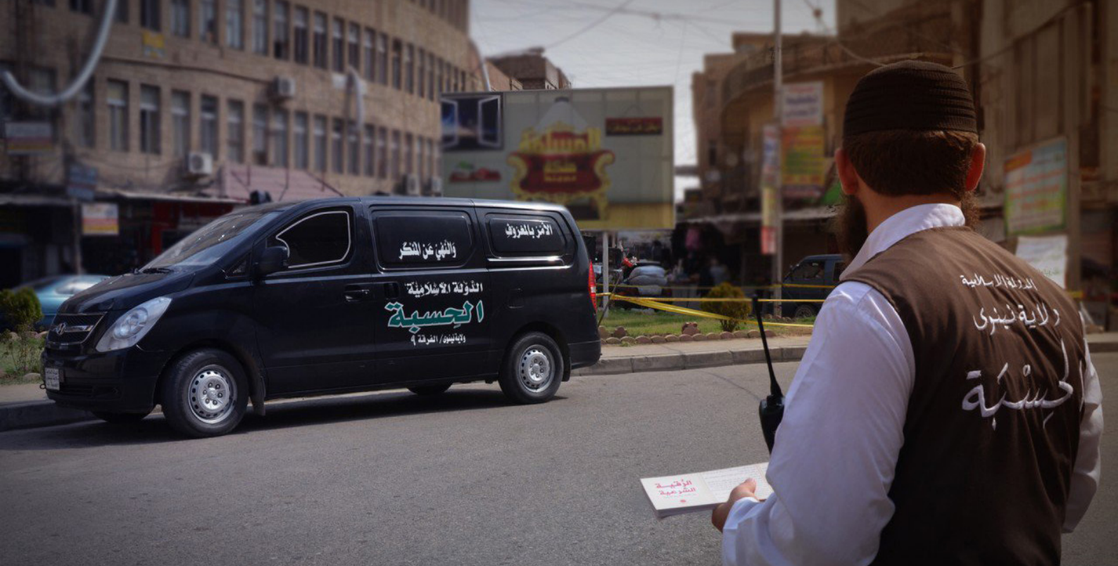
The banners of jihad and hisbah cannot be raised without wala and bara

about that. And among them are those who encourage you to leave Dar al-Islam with the excuse that the war against it has intensified, among other statements of scaremongering and deviance!