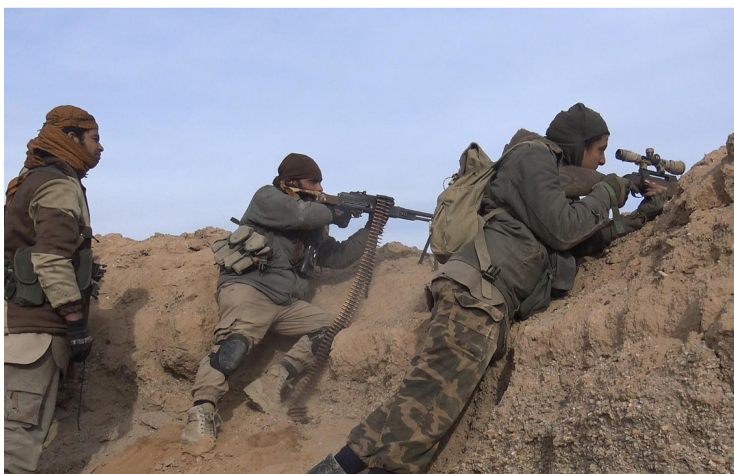
The soldiers of the Khilafah in Khayr Wilayah battle the Nusayri murtaddin