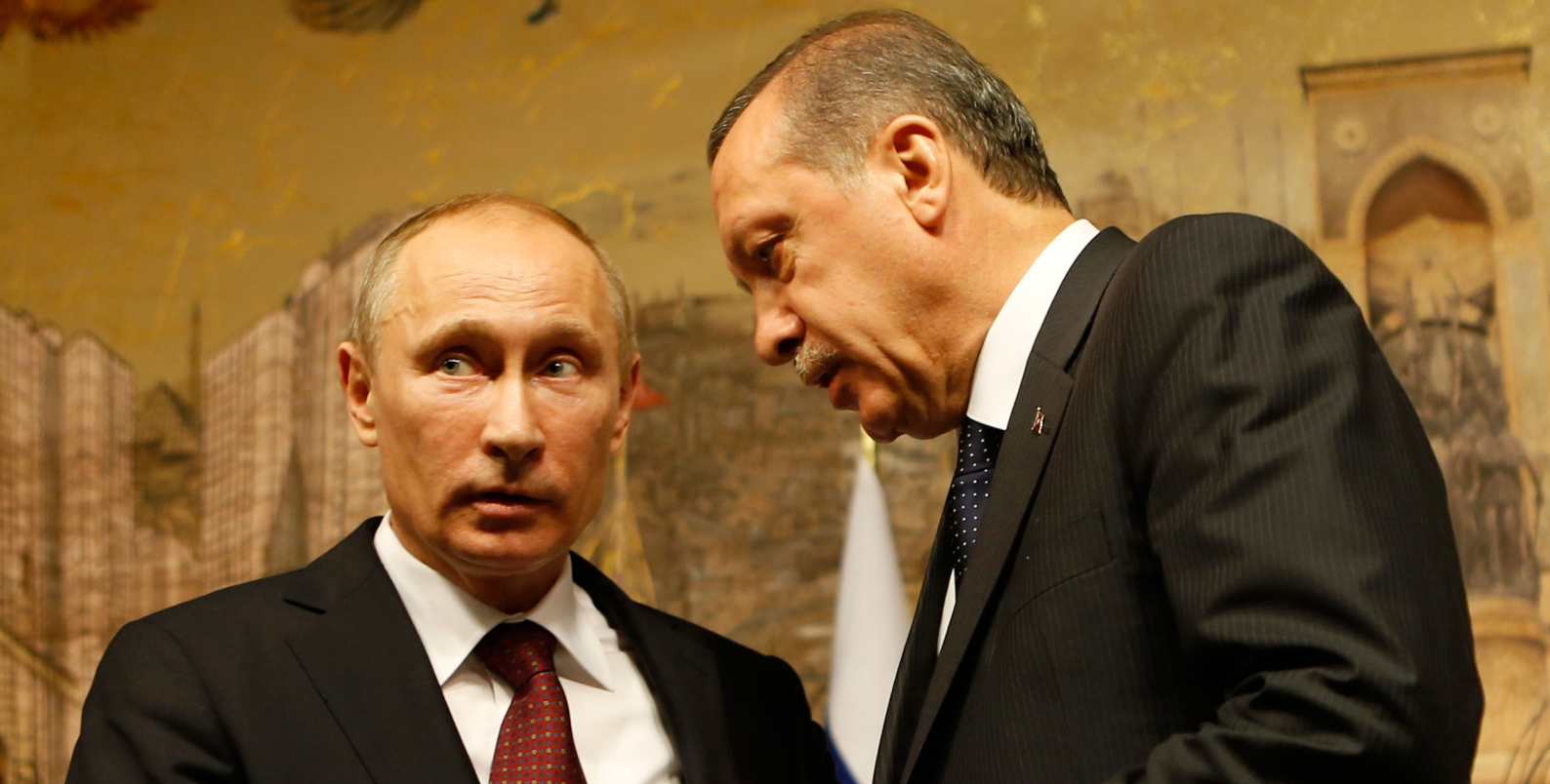
The murtadd, Erdogan, with his Crusader ally, Putin

a barrier to block Islamic State mujahidin from reaching their lands.