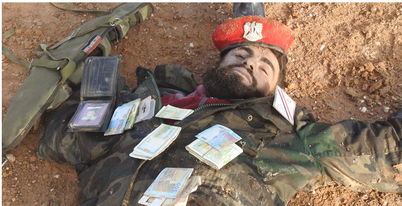
A dead murtadd killed while fighting for the Nusayri regime

His statement, “Those [believers] who responded to Allah and the Messenger after injury had struck them. For those who did good among them and feared Allah is a great reward” (Al ‘Imran 172).