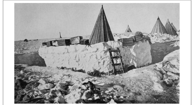
Figure 4. Roald Amundsen's meat tent at Framheim – from Amundsen's The South Pole .

Meanwhile, Roald Amundsen and his Norwegian team on the 1911–1912 Fram expedition knew no more than Scott about the existence of vitamins or the dietary mechanisms of scurvy, but Amundsen had first-hand experience from both polar regions of how to prevent and cure it. After his time with Frederick Cook in the Belgica , Amundsen had led the first expedition to sail the full length of the Northwest Passage. In doing so he spent nearly two years among the Netsilik Inuit in the Canadian Arctic, and stayed healthy eating as they ate. It did not take him long after returning to Antarctica to put his knowledge to work.