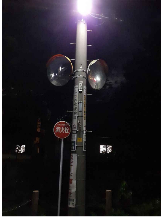
Figure 2. Poles at night.

and wires has become just like an archetypal image ( gen-fūkei ) for the Japanese who were born and have grown up in the cities' (Adachi and Inoue, 2011: 27).