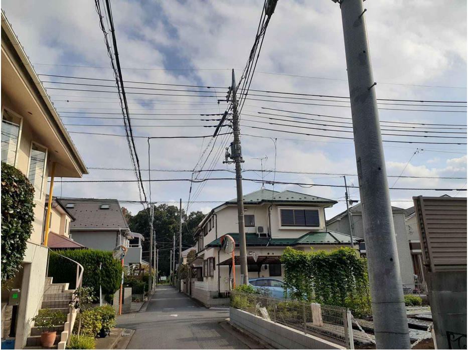
Figure 1. Poles and wires.

(see Figure 1). 1 This movement is part of a larger campaign from recent decades to beautify Japan, which has become more visible of late in anticipation of the Olympics in Tokyo in 2021, and seen in the policy statement of the Ministry of Land, Infrastructure, Transport, and Tourism to bury them underground (MLIT, 2003).