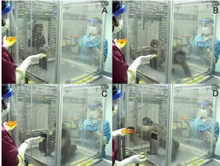
Figure 1: A capuchin decides which experimenter to trade with. The subject enters the testing chamber (A), takes a token from a tray (B), places it in the hand of an experimenter (C), and receives a food reward from a tray in his other hand (D). The film clip from which these are drawn is available from the corresponding author on request.