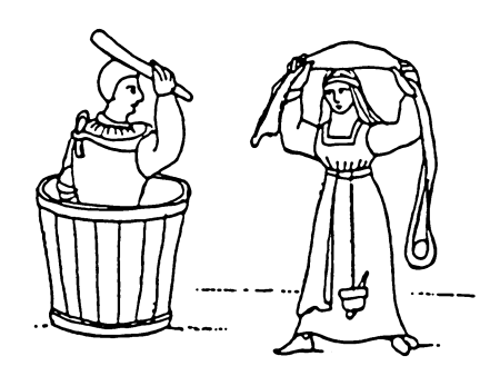
Fig. 3 Judicial Duel between Husband and Wife

who can bear more patiently with a hen that lays a fresh egg every day than with their own wives; and sometimes when the hen breaks a pipkin or a cup he will spare it a beating, simply for love of the fresh egg which he is unwilling to lose. Oh, raving madmen! who cannot bear a word from their own wives, though they bear them such fair fruit; but when the woman speaks a word more than they like, then they catch up a stick, and begin to cudgel her; while the hen that cackles all day, and gives