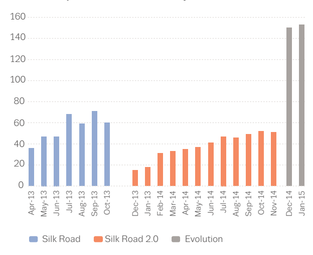
Number of questions answered by month

they are selling. The attitude of DWM administrators and moderators has also been very collaborative: the thread has always been highlighted, and technical or general support has been offered in all cases. The popularity of the thread has increased, as shown in Figure 7.1, where the number of questions answered each month in the three markets during a 22-month period is presented.