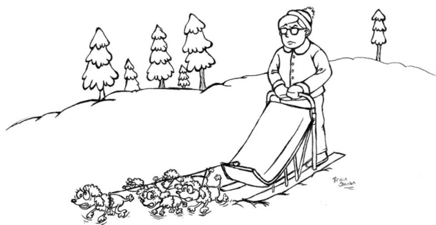
Richard Lewontin creates a dog sled team to test his theory that small genetic differences are irrelevant.

Tables 1 and 2 show that authors frequently perpetuate logical fallacies related to intelligence in their introductory psychology textbooks. Indeed, nearly all the fallacies from Gottfredson's (2009) list appeared in at least one book, indicating that these specious arguments about intelligence research are commonly disseminated. Other examples of these logical fallacies in the textbooks can be found in Supplemental File 1 (pp. 3–21).