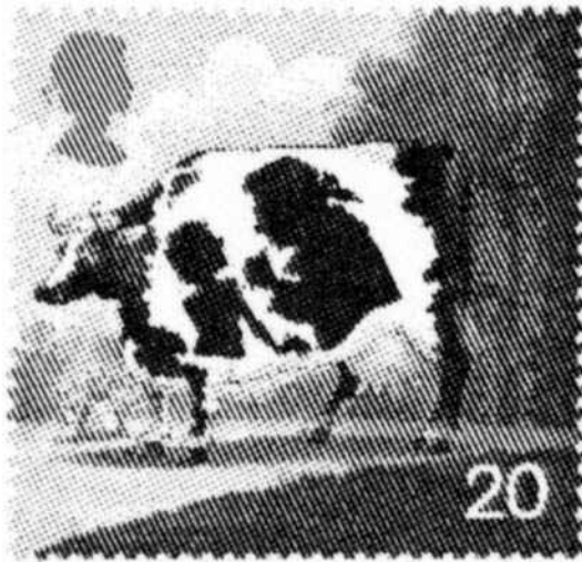
Figure 3. British 1999 Vaccinating Child 20p stamp, (Source: Stamp Designs @ Royal Mail Group Ltd. Reproduced by kind permission of Royal Mail Group Ltd. All rights reserved.)