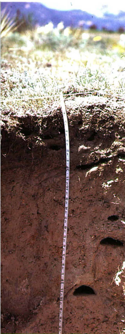
Profile of M. mexicanus nest showing domed replete chambers.

round opening, about 1.2 cm in diameter, surrounded by a crater. The average crater is 2 cm high and 11.6 cm in base diameter. Australian nests lack craters and have either a single entrance or multiple entrances in the thatch under mulga trees.