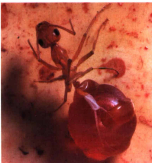
M. mexicanus semireplete that developed from a worker in a laboratory nest supplied only with red-dyed water.

Entrances to American and Australian nests differ in size, shape, and number. The M. mexicanus entrance is usually a single