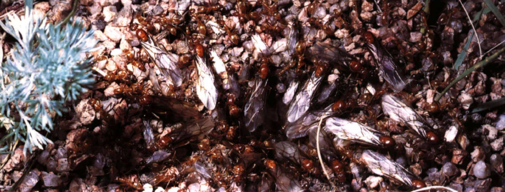
Winged queens and winged males leaving M. mexicanus nest just before mating flight.

I went to Australia in 1984 to locate honey ants and, after some difficulty, found them with the help of an Aboriginal family near Alice Springs. Although several honey ants are found in Australia, only the large repletes of C. inflatus are eaten by Aborigines. In July and August, 1987, I returned with three Earthwatch expeditions to determine nest architecture, density, population size, food sources, foraging patterns, and intra- and interspecific interactions.